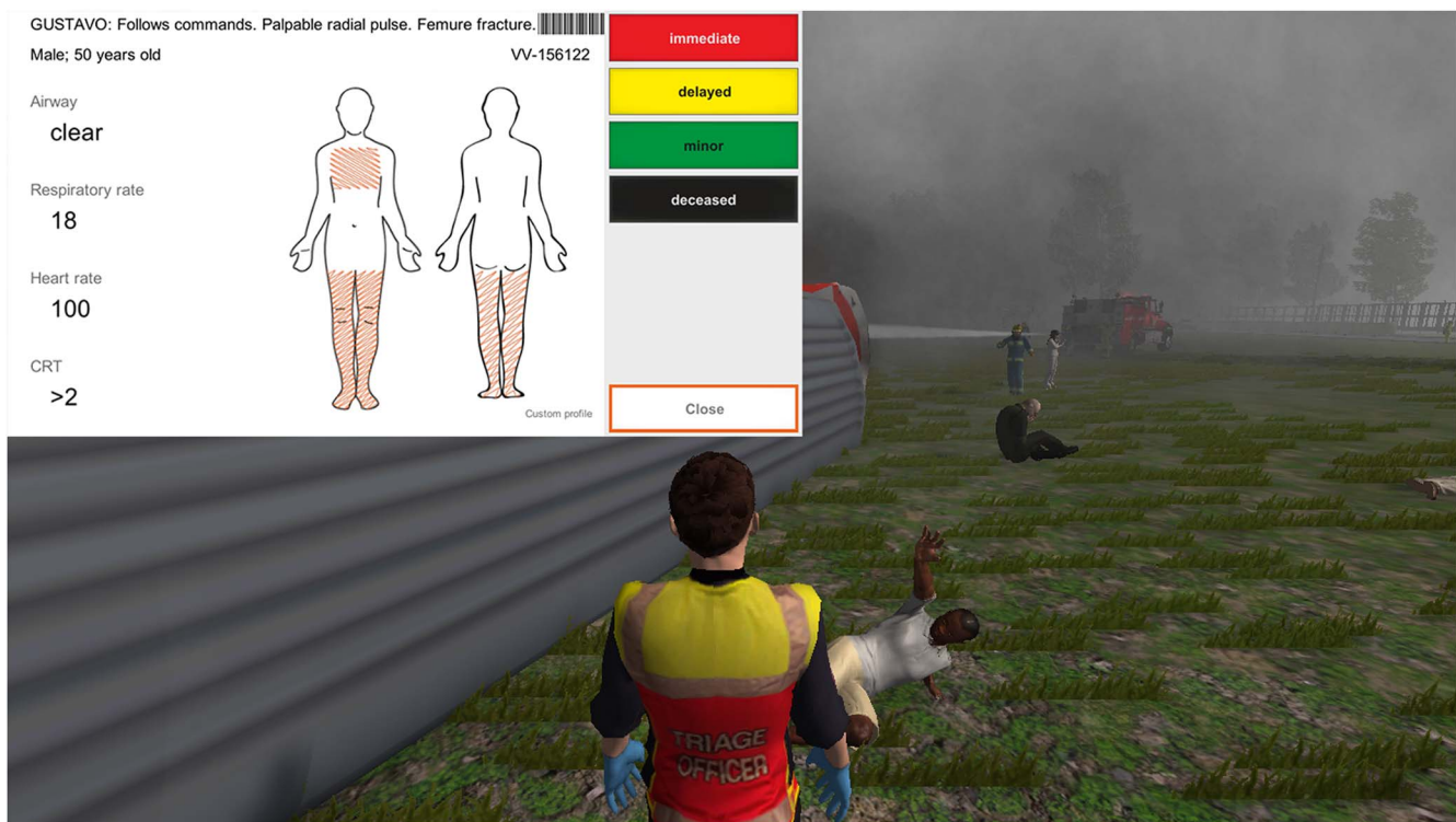
Figure 1. A screenshot of the virtual reality scenario environment with an example of Triage Card visualized during the simulation.

To create the study scenario, ten real patient scenarios with known outcomes were taken from the database of over 100 case descriptions from the 2008 train accident in Chatsworth, Los Angeles, and the triage cards of the virtual victims were created (Table 1). For each victim, real clinical conditions, including general victim data, such as sex, age, nature of injury, and physiologic parameters, were imported into the software. These parameters included respiratory rate, capillary refill time, radial pulse, level of consciousness in terms of ability to follow simple commands, and the ability to walk. The patients were distributed in a realistic fashion based on real life locations from the Chatsworth train crash.