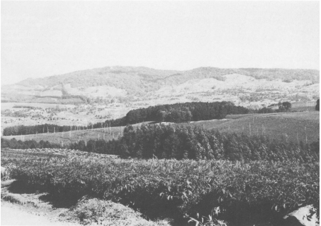
Figure 3. Mt Thyolo, with the hill forest eaten into by cultivated land; tea and Eucalyptus plantations in the foreground.

extended from 900 to 1800 m, and aerial photographs show that it still covered 40 sq km in 1974, thus being the largest single block of forest in Malawi. Destruction has accelerated in the last few years and little forest now remains below 1500 m (Figure 2). The wood is wasted, and maize gardens established on steep rocky slopes are soon washed away, encouraging further felling. These Newtonia -dominated forests are not only an ecosystem of considerable scientific interest, but also provide a vital source of water—in particular for the foreign-exchange-earning tea estates extending over the plains below.