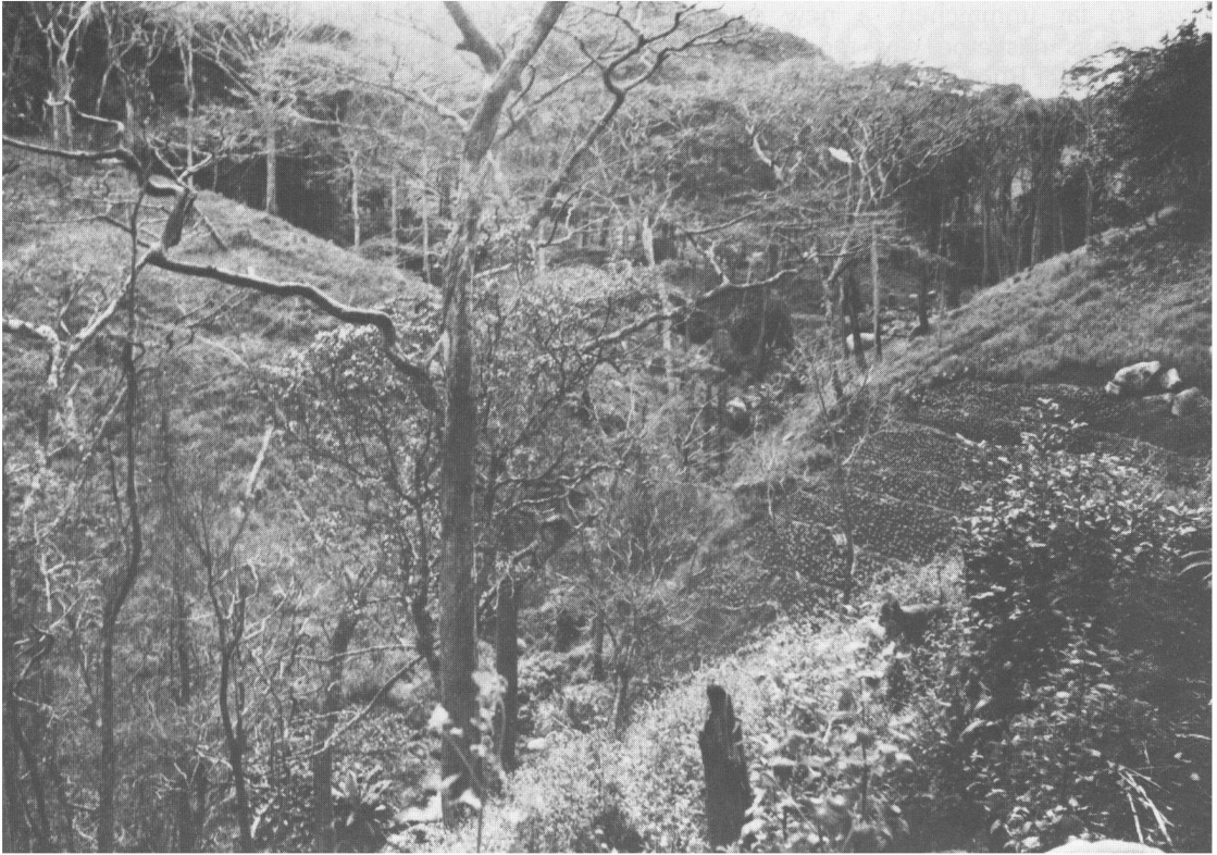
Figure 2. Large tracts of Chinsongeli Forest, Mt Mulanje, have been cleared for the planting of annual food crops.

Some 14 forest-associated butterflies are apparently endemic to Malawi, of which eight occur in the south, with three only on the slopes of Mt Mulanje: the lycaenids Alaena lamborni , A. ochracea and Baliochila woodi (Mulanje); the nymphalids Charaxes margaretae (Mulanje), C. martini , C. chinteche (north also), Cymothoe zombana and C. melanjae (Mulanje).