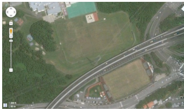
In this aerial view, the soccer pitch (bottom right) is seen separated by an

Directly adjacent to the barrels' dumpsite - on the other side of the fence - within Kadena Air Base, there are two Department of Defense schools - Bob Hope Primary School and Amelia Earhart Intermediate School. Inquiries to both the Pentagon and United States Forces Japan as to whether dioxin checks would be conducted there were unanswered at the time of publication.