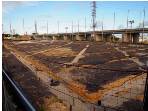
The soccer pitch in Okinawa City where the 22 barrels were unearthed.

Clapp stated, "The Okinawa data, if accurate, are comparable to recent hot spot data collected in Vietnam. About half of the dioxin levels are above what (scientists) consider significant contamination."