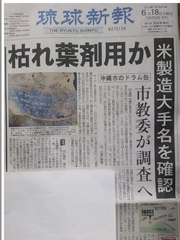
The discovery made headlines in Okinawa, including the Ryukyu Shimpo newspaper.