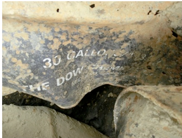
Some of the barrels were marked Dow Chemical.

Meanwhile, an Okinawa Defense Bureau spokesperson told The Japan Times last week that the possibility that they contained defoliants was slim. 4 The ODB stressed the fact that it failed to find traces of one of the other ingredients of Agent Orange, 2,4-Dichlorophenoxyacetic acid (2,4-D). However it neglected to mention that 2,4-D is biodegradable and so would have broken down in the years since the barrels had been buried - rendering detection likely impossible.