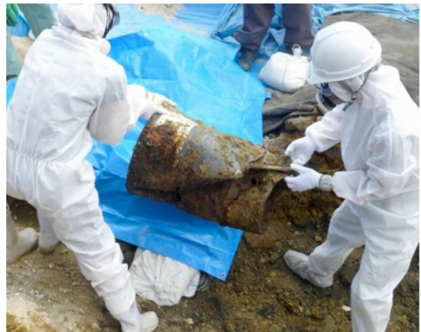
Workers unearth the barrels discovered beneath a soccer pitch in Okinawa, City.

revealed levels 280 times legal limits. Both 2,4,5-T and TCDD are two of the substances found in Agent Orange and other Vietnam War era defoliants. At least three of the barrels were labeled with markings from Dow Chemical Company - one of the primary manufacturers of Agent Orange.