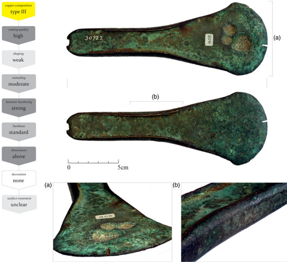
Figure 5. Left: Chaîne opératoire of axe 153. Right: Axe 153, a type Gretchen variant D from Glattfelden in Switzerland, from the banks of the Rhine (Abels, 1972: 82, no. 584). Overall, a very crude axe with major casting errors, roughly worked flanges, and a blunt blade.

that hardens well. Axe 153 is a good example of the difficult relationship between quality and skill, a relationship that is subject to the purpose of the object (Kuijpers, 2015a), and the constant tension between correctness and functionality (Sennet, 2009: 45).