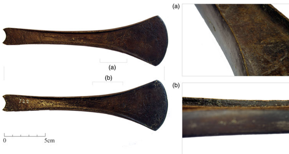
Figure 4. Axe 288, a type Meilen from Meilen in Switzerland, context unknown (Abels, 1972: 41, no. 299). Note the high and sharp contours of the flanges.

Nonetheless, according to the metallographic analysis, the axe was worked further despite this casting fault. The blade has seen strong hammer-hardening, seemingly with the aim of creating a harder edge (Kienlin, 2008: 432, sample no. 601501). This took the hardness of the blade far above that of most contemporary axes in the Early Bronze Age (HV [Vickers Hardness test] 260). If axe 153 was made with the intention to produce a functional tool, the quality is probably best assessed on the hardness of the blade. From this mechanical viewpoint alone, this axe should be considered well-made, despite the lack of metallurgical skill implied by the casting fault and careless finish. The resulting qualitatively good tool owes much to the inherent affordances of the material used, a tin-bronze