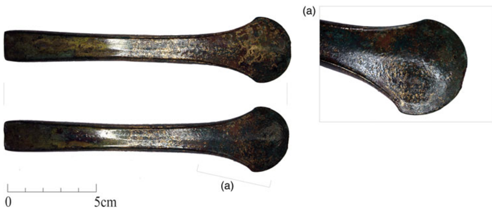
Figure 2. Axe 280, a type Lausanne, variant Gemeinlebern, from Gemeinlebern in Austria, found in a grave (Mayer, 1977: 85, no. 253). Though similar to axe 281, less care was given to the details of this axe.

the uneven dents; although we cannot exclude the possibility that the decoration had been conceptualized beforehand and