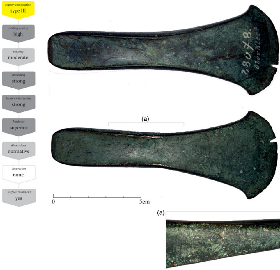
Figure 7. Left: Chaîne opératoire of axe 56. Right: Axe 56, a type Saxon from Sobechleby in the Czech Republic, a hoard find (Stein, 1979: no. 248). A well-worked axe stressing the qualities of the material it is made from.

close look at one flange shows that small cracks appeared (Figure 6a); but, compared to axe 287, its maker knew exactly when to stop hammering to prevent fractures from developing.