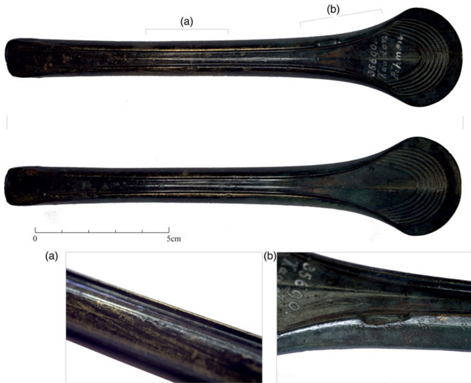
Figure 1. Axe 281, a type Lausanne from Kadaň in the Czech Republic, stray find. The axe has a sharp blade, is very well polished, decorated, and has a remarkable symmetry overall.

this means in terms of skill. The decoration was probably made after casting, by chiselling and subsequently grinding away