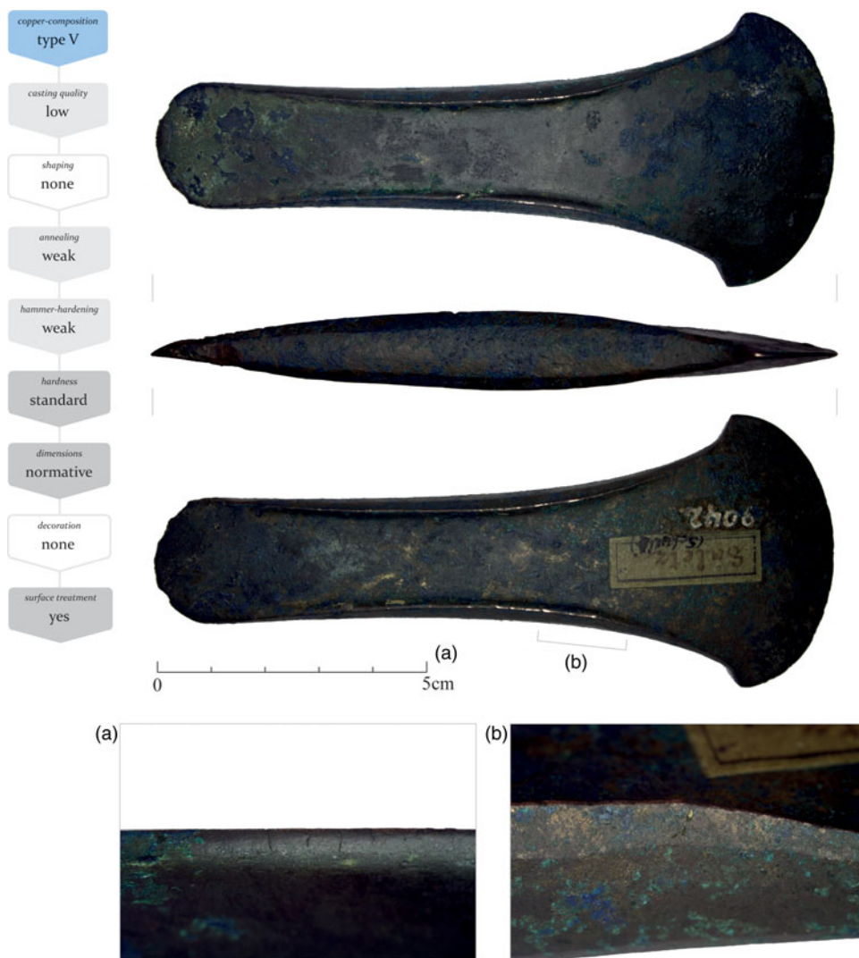
Figure 6. Left: Chaîne opératoire of axe 3. Right: Axe 3, a type Salez from Sennwald-Salez in Switzerland, a hoard find. Note the starting cracks (a) in the flange.

Prehistoric craftspeople recognized and appreciated these differences, as can be observed in a chaîne opératoire (Figures 6 and 7). The blade of axe 3 was worked carefully and received a weak hammer-hardening only (Kienlin, 2008; 452, sample no. 101202), probably because of the poor casting quality and general brittleness of this material. The flanges probably also saw light hammering to shape them. A