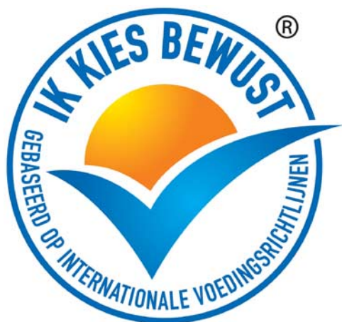
Fig. 1 The Ik Kies Bewust ('Choices') nutrition logo