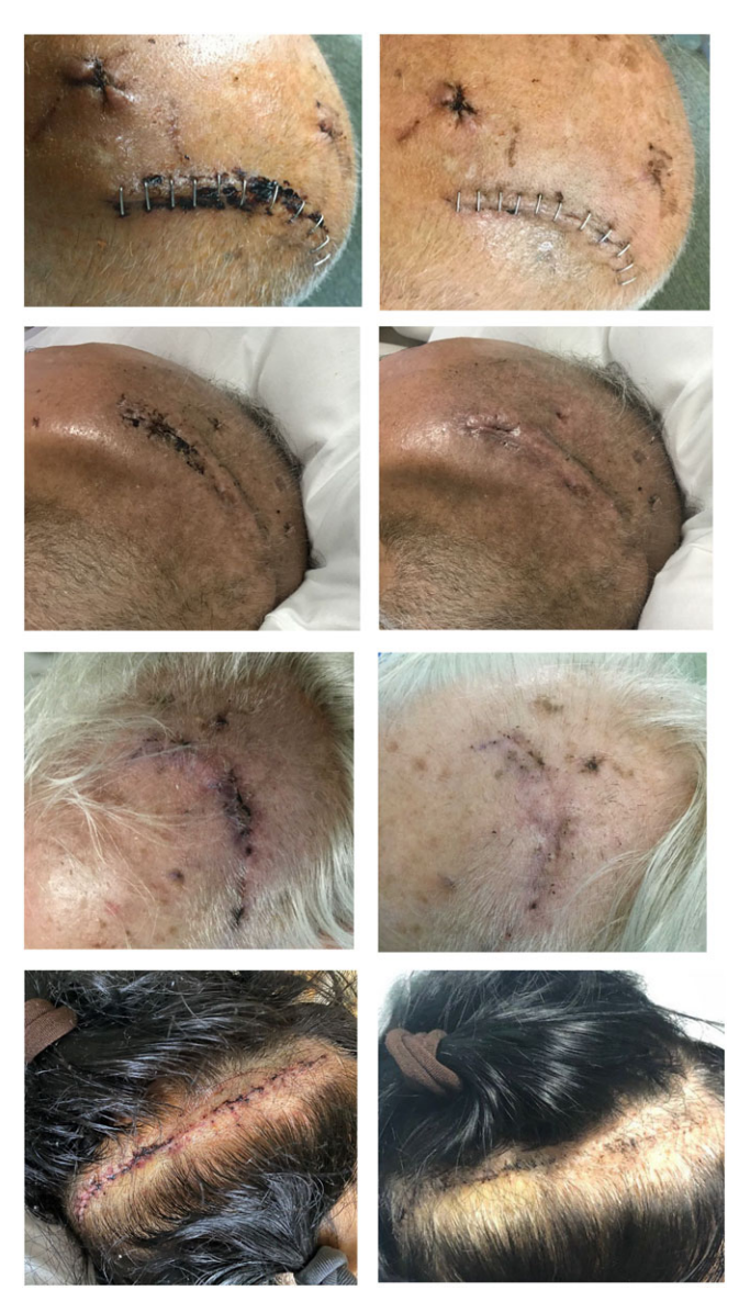
Figure 1. Examples of pre-intervention and post-intervention craniotomy wounds during photo-documentation monitoring.

(0.9, 3.0), p = 0.08) were associated with increased odds of SSI. In multivariable analysis, the wound care intervention remained significantly associated with reduced SSI while procedure duration, and emergent or trauma-related surgery remained positively associated with SSI (Table 3).