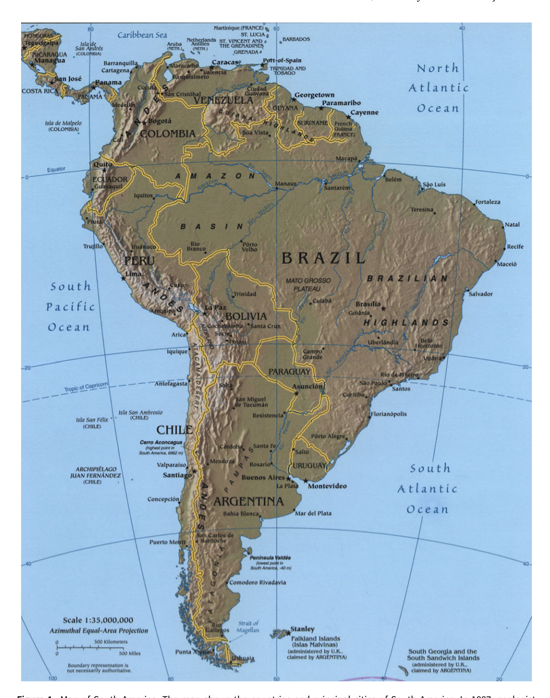
Figure 1. Map of South America. The map shows the countries and principal cities of South America. In 1887, geologist Clemente Barrial Posada suggested that the inter-American railway run from Bogotá, the capital city of Colombia, to Buenos Aires, Argentina, and from there to Recife on the Brazilian Atlantic Coast. Other South American experts promoted an interoceanic railway from Recife to Valparaíso on Chile's Pacific Coast. Scale: 1: 35,000,000.