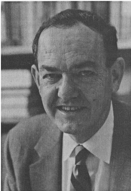
Nobel Prize winner Herbert A. Simon of Carnegie-Mellon University will be a panelist on the first annual Lasswell Symposium at the 1982 APSA Annual Meeting on September 3 in Denver.