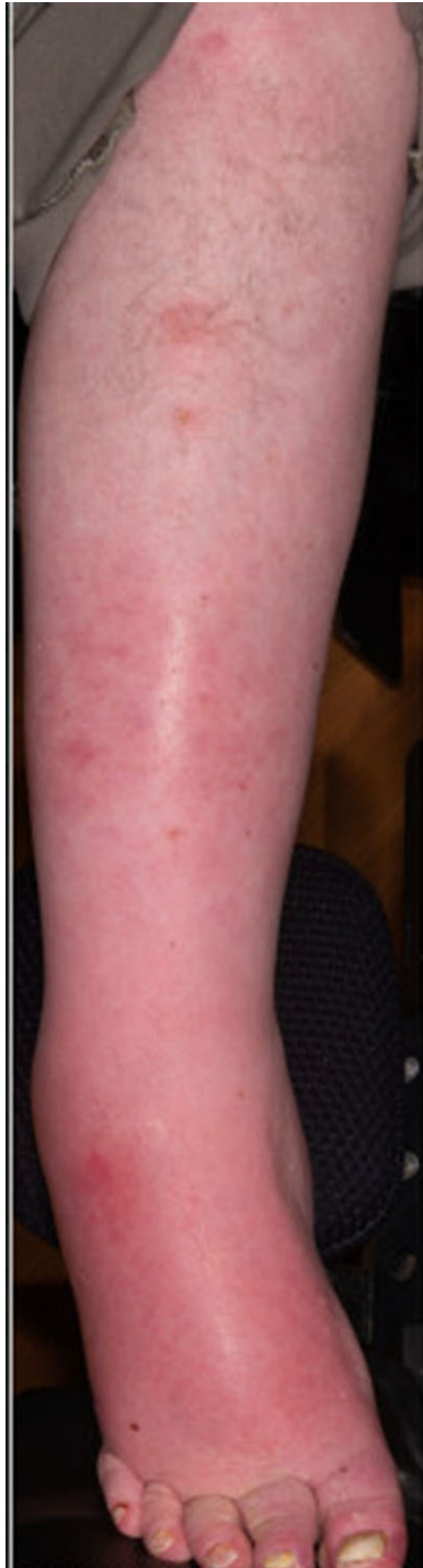
Figure 2. Infection of the legs in a 35-year-old Duchenne patient with a history of bilateral pitting oedema. The degree of oedema noted in the photograph is baseline, and the erythema was new at the time of infection. Photographic consent was obtained from the patient prior to use of the photo for this manuscript.

and > 400% risk of lower extremity oedema, respectively. 17 Among adults, obesity has been identified as a risk factor for both the development of oedema and for subsequent cellulitis and hospitalisation. 8,18 The causes of oedema in obesity are likely multifactorial including structural lymphatic abnormalities, elevated venous pressures related to intra-abdominal pressures, and venous insufficiency. 19 It remains unclear how each of these factors relate