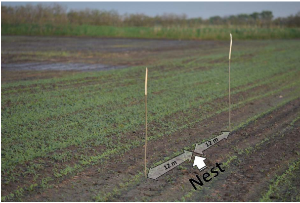
PLATE 2 Protection zone around collared pratincole nest, marked temporarily by 1.5 m-tall wooden poles. This photograph was taken using a telephoto lens that distorts the actual distance between the two wooden poles.

The survival and productivity of ground-nesting birds are influenced by predation (Martin, 1993; Roodbergen et al., 2012; Kubelka et al., 2018). To investigate relationships between pratincole breeding success and number of nest predators removed from the study area, we collected data from hunters. Potential huntable nest predators include mammals (red fox Vulpes vulpes , golden jackal Canis aureus , European badger Meles meles ) and birds (Eurasian magpie Pica pica , hooded crow Corvus cornix ). We requested hunting bag data from professional hunters for the period 2017–2021 and we aggregated the number of individuals killed for each year. Hunting bag data relate to the regional hunting district (c. 26,000 ha), which covers c. 65% of collared pratincole nest sites (National Game Management Database, 2022).