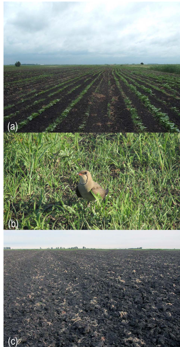
PLATE 1 Main breeding habitats of collared pratincoles Glareola pratincola in Hungary: (a) row crop, (b) spring cover crop, (c) fallow land.

During the incubation period, we checked all of the nests remotely using a spotting scope every other day. The incubation period was 18 days (based on Myhrvold et al., 2015, and our field observations supplemented with use of the egg-floating methodology; see details in Székely et al.,