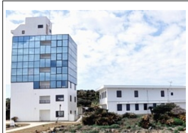
“Beyond the Law” Tasuton Airport Buildings, Mage Island February 2010

presumed to be staff quarters, 12 keen also to investigate apparent breaches of various laws including the Forest Law and to survey the deer population because of suspicion of its drastic decline.