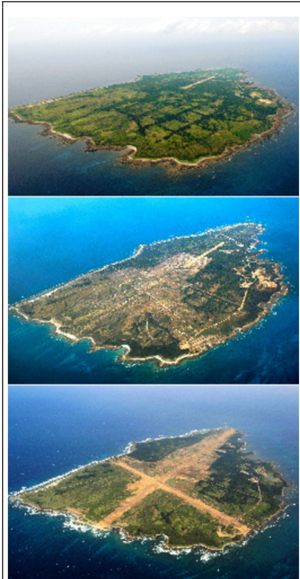
showing apparent breach of forest law by unlicensed development From top down, the island in June 2004, November 2006, and July 2011

comparable to Tokyo's Narita or Osaka's Kansai emerged on the uninhabited island. 4