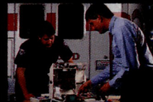
UNSURPASSED TECHNICAL SERVICE