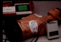
CLINICAL SUPPORT AND TRAINING TOOLS