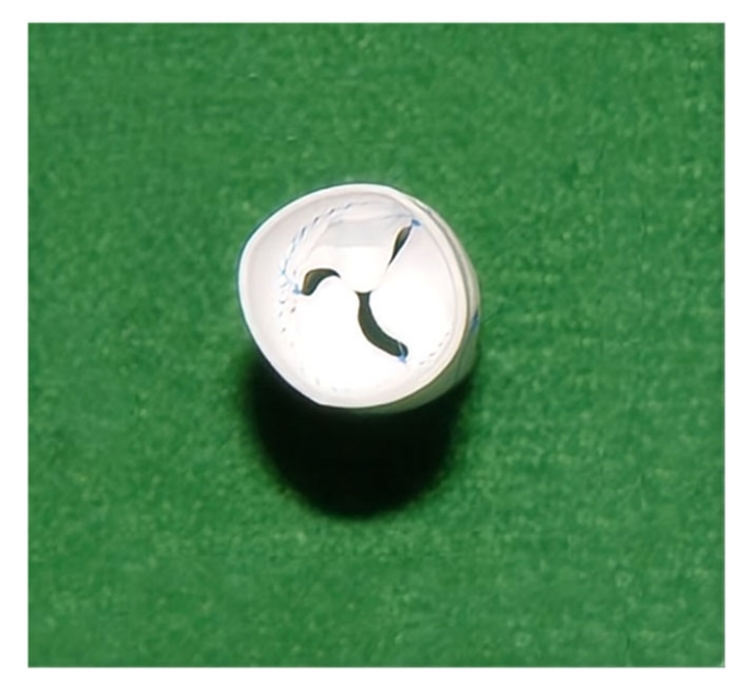
Figure 1. A hand-sewn trilobed valved ePTFE conduit from our institution is shown.