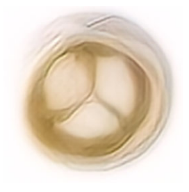
Figure 3. BJVC.

expanded polytetrafuoroethylene conduits performed in a single institution. No significant difference in peak right ventricular outflow tract velocity (1.8 \pm 0.9 \text{ m/s} \text{ versus } 2.1 \pm 0.9 \text{ m/s}, p = 0.27), branch pulmonary stenosis (p = 0.50), pulmonary regurgitation (p = 0.44), and conduit infection or conduit replacement (20.0% versus 8.3%, p = 0.43) were found between the valved bovine jugular vein conduit and expanded polytetrafuoroethylene conduit groups, respectively. Aneurysmal dilatation of the conduit was observed in 25.0% of the patients in the valved bovine jugular vein conduit conduit group but not in the expanded polytetrafuoroethylene conduit group (p = 0.011). They suggest that expanded polytetrafuoroethylene conduits are appropriate for patients with risk factors of branch PS to prevent aneurysmal conduit dilatation. Hui-Feng Zhang et al.<sup>30</sup> reported the medium and long-term efficacy of valved bovine jugular vein conduit implantation in Chinese children. Fifty-three hospital patients implanted with valved bovine jugular vein conduit conduits from January 2002 to December 2013