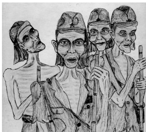
A picture drawn by one of the surviving soldiers in New Guinea

Okuzaki and his fellow soldiers of the 36 th IER and other troops of the 18 th Army began at this point. When they reached Wewak in January 1944, they were ordered to retreat further west to Hollandia in West (Dutch) New Guinea, 400 kms from Wewak. There was a Japanese base in Aitape, which was located almost half way to Hollandia. Yet, as mentioned above, the Japanese bases in Aitape and Hollandia were attacked and taken over by the Allied forces well before the Japanese troops even reached Aitape. 13