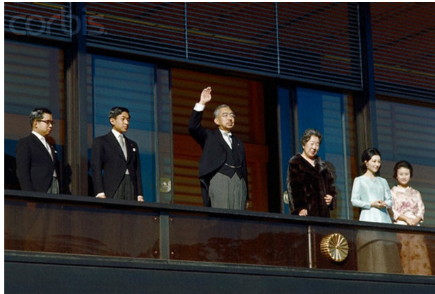
Scene of the Pachinko Ball Attack, Emperor Hirohito at the Imperial Palace, New Year 1969