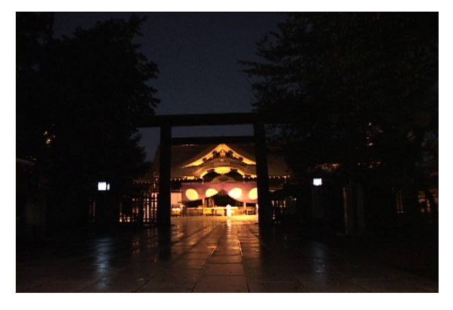
Yasukuni shrine at night.

Its name translates as "peaceful country," millions have silently prayed there for an end to wars, and for much of the year the loudest sound is the buzzing of insects and the shuffle of old footsteps to the hushed main hall. Yet Yasukuni Shrine, which occupies a single square kilometer of central Tokyo, is one of the most controversial pieces of real estate in Asia, resented by millions who consider it a monument to war, empire, and Japan's unrepentant and undigested militarism.