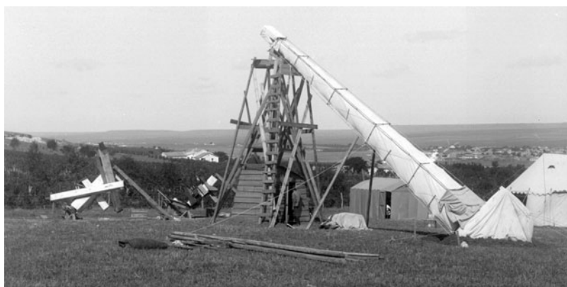
Figure 4. Set of instruments of the ONA; at the right back, Feodosia.