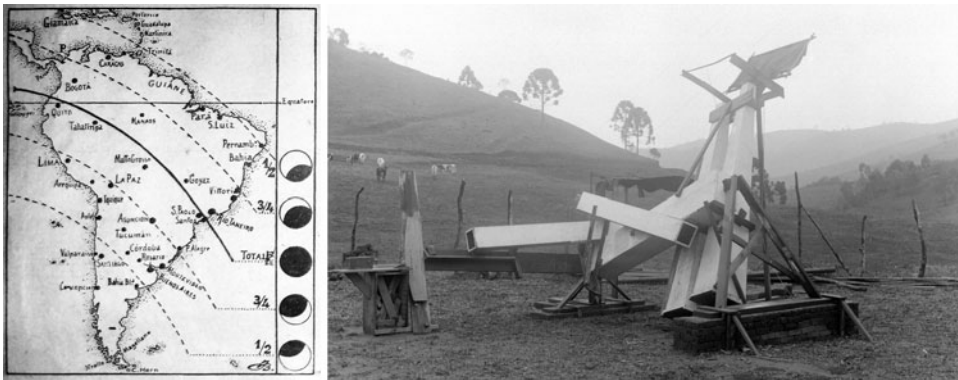
Figure 2. Cristina, state of Mina Gerais, Brazil, was the designated site to observe the eclipse of 1912. The path of totality is shown at the left, as published in the newspaper La Argentina from a manual plot (9/10/1912). The photograph at the right shows the cameras installed and ready to be used.

Observatory to take the necessary photographs during the eclipse that would be seen in Brazil on October 10 of that year. Perrine accepted the challenge and included this investigation in the expedition that was being arranged for the study of the aforementioned eclipse.