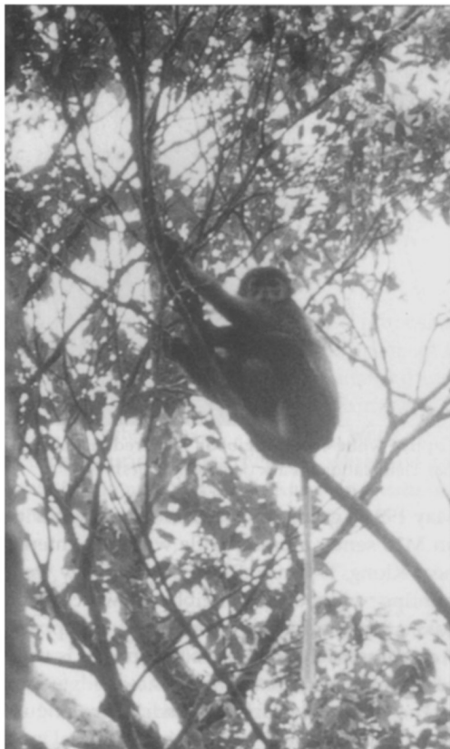
A male black-shanked douc langur photographed on Deo Nui San, Di Linh Plateau. This is almost certainly the first photograph taken in the wild of this species.

recorded. Both species were being offered for $US 200 each (Eames and Robson, 1992). It has been claimed that the red-shanked douc langur is unknown in the pet trade and seldom appears in the Saigon market (Ratajszczak, 1989). Because its sibling species clearly is traded this claim should be treated with caution. It is interesting to note that a pileated gibbon Hylobates pileatus was being offered for sale $US600. This species does not occur in Vietnam and, according to the owner, this individual was obtained in Cambodia (Eames and Robson, 1992). However, it has been suggested that a small part of its range lies within Vietnam (Ratajszczak, 1989).