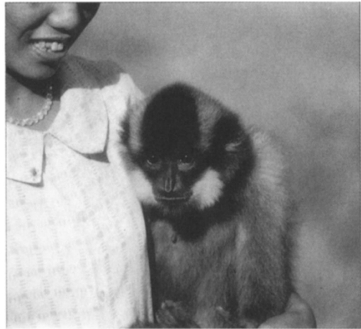
Captive white-cheeked gibbon captured in Nam Bai Cat Tien National Park (Jonathan Eames).

Both white-cheeked gibbons and black-shanked douc langurs are subject to hunting on the Da Lat and Di Linh Plateaux. On 18