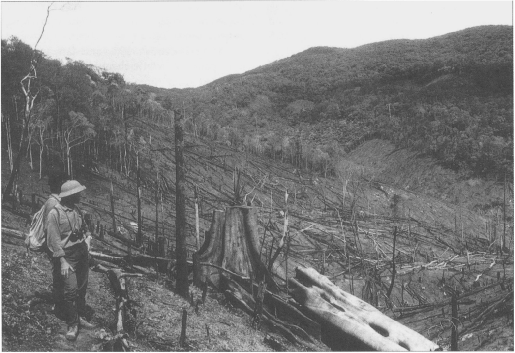
Deforestation by hill-tribes on the Di Linh Plateau – habitat of black-shanked douc langur.

a range of forested hills between c. 150 and 300 m in elevation, while the centre and east are level lowland. The vegetation comprises a mosaic of primary evergreen forest and secondary forest formations, including bamboo, resulting from logging and agricultural clearance. Riparian habitats, including swamp forest, are found in the centre of the park. The forests have been classified as lowland semi-evergreen (MacKinnon and MacKinnon, 1986) and closed broadleaved tropical evergreen seasonal lowland (mostly dominated by Dipterocarpaceae, Fabaceae, Meliaceae and Sapindaceae) with closed bamboo tropical lowland and sub-montane forest (CVRER, 1985).