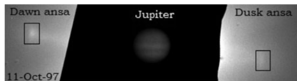
Figure 1. Image observed in October 11, 1997 at the McMath-Pierce Solar Telescope. Jupiter is at the center of the image, attenuated by a neutral density filter. The dawn and dusk ansae are at the borders of the image, delimited by a box. The box area was the region used to obtain each ansa brightness.