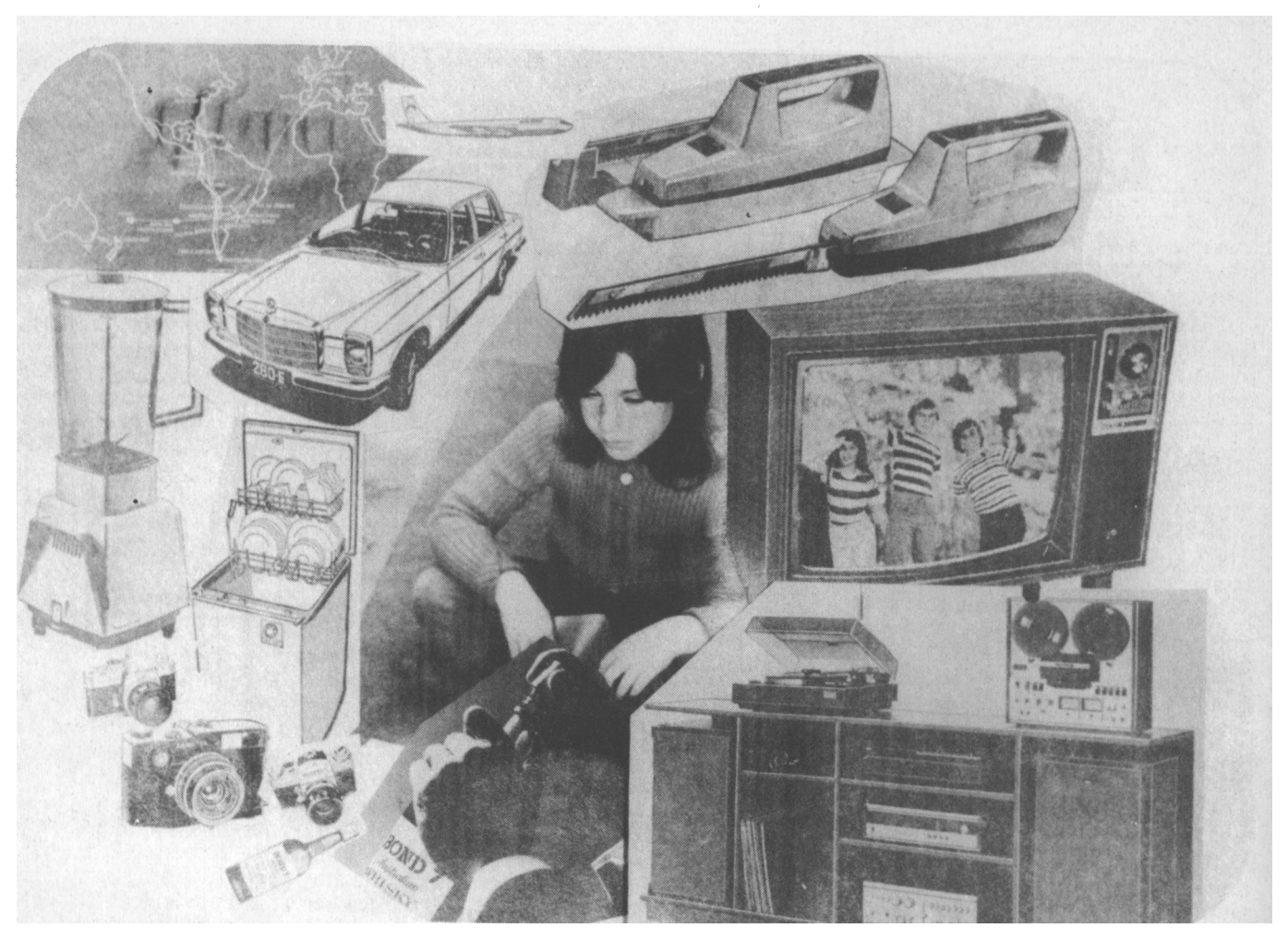
blaming society, then in the long run it is possible that society itself could be changed.

terest of a consumer orietated society very well. Further, if one accepts the proposition that the family is a social institution, then one can view it as a microcosm of society. This perspective has the distinct advantage of circumventing the all too common feeling of apathy that so many people suffer from, whereby they project the blame for their own ills and discontents onto the broader macrocosmic level of society and despairingly come to believe that there is nothing they can do about the quality of their own lives. But in viewing the family as a microcosm of society then each of us at least can see that we have the opportunity of working out our personal solutions to societal problems within the confines of our own family life. It is not, naive to suggest that if more people took responsibility for their own lives and did not forsake this responsibility by