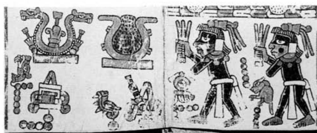
Figure 3. Vienna Codex, p. 50d-51a.