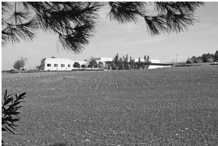
Figure 1.1 A view of ICARDA's facilities in Tal Hadya, Syria, 2007.

Born of the Cold War, ICARDA emerged from exercises of European imperialism, Great Power rivalries, and the concomitant restructuring of a patchwork of modern nation-states in Western Asia and North Africa. In the aftermath of World War II and European withdrawal from formal governance, newly independent nation-states became battlegrounds of the Cold War. The southern rim of Asia, which provided a buffer to the Soviet Union, became a focus of US strategies of containment from the 1950s. Scholars have attended to the global movement of soldiers, arms, and aid that fueled Cold War conflict in the “killing fields” of the Asian rim. 3 They have paid less attention to the ways in which the institutional development of international research organizations served Cold War objectives. 4 The founding of ICARDA was part and parcel of the