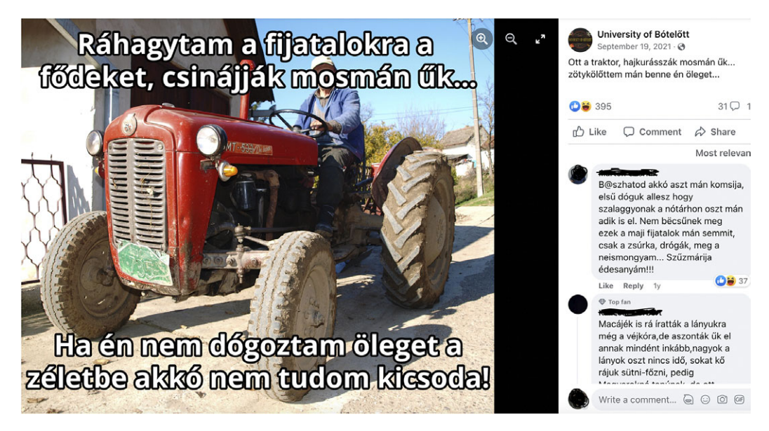
Figure 1. Post and meme from the UoB Facebook page. All memes are reprinted by permission from the authors of the pages.

An example of this is shown in Figure 1, which is a screenshot of a meme, post, and comments in the UoB Facebook page.