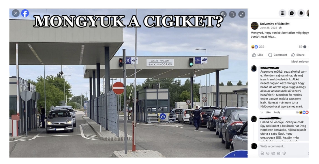
Figure 6. Post and meme from the UoB Facebook page.

and "unopened" refers to boxes of cigarettes allowed to take across the border, and that to "tell" means to "report" in this context, and would not guess that "Hungarian" and "Serbian" refer to passports.