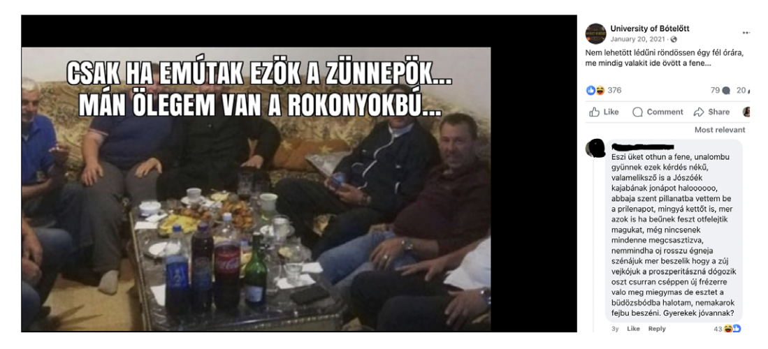
Figure 2. Post and meme from the UoB Facebook page.

the region refer to it. It means that like language, identity is perceived as deriving from more than one community; conversely food eaten at home is often not connected to one ethnic group but is rather a mixture of various ethnic foods found at most dining tables in the province, creating a distinct "culinary citizenship" (Mannur 2007). The memes and posts therefore feature food such as ham, eggs, and horseradish, traditionally served for Catholic Easter, pogácsa, paprikás, madártej , and barátfüle , traditional Hungarian home-made dishes and sweets, but also gyuvecs, csevap, ajvár, tursija (which are the Hungarianized spelling and pronunciation of the Serbian words đuveč, ćevap, ajvar , and turšija ), that are consumed in the Balkan countries, as well as bean stew and chicken soup, that can be found on the home menu all around the region regardless of ethnic membership.