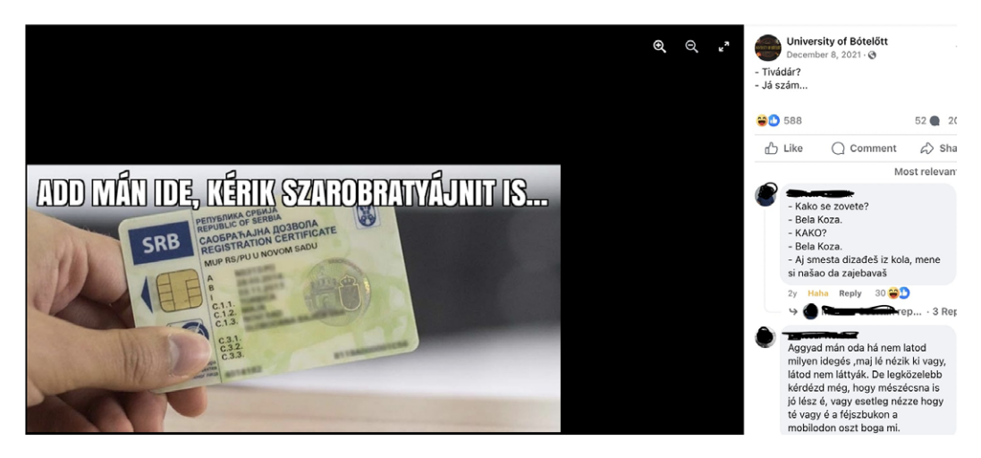
Figure 3. Post and meme from the UoB Facebook page.

"inspection"), koverta (from koverat, instead of boríték, meaning "envelope"), smiga (from žmigavac, that means "blinker" in Serbian), pruszlik (from prsluk, instead of mellény, meaning "vest"), kopacska (from kopačka, for "football boots"), etc.