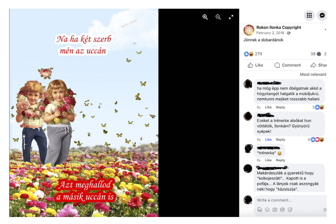
Figure 4. Post and meme from the Rokon Ilonka Copyright Facebook page.

posts of Rokon Ilonka deal with Serbian people and both contain explicitly or implicitly negative stereotypes uttered by imaginary characters. The first one can be read as a piece of marital advice given by a parent or a grandparent to a young man: "Son, look for a Hungarian one / I don't want mules here," with the post: "Catholic, respectable, and Hungarian!".<sup>8</sup> Here, mules allude to (grand)children born from an ethnically mixed marriage and are seen as bearing a negative identity. The second meme can be seen in Figure 4 and shows two characters in tracksuits, which is presented as the stereotypical clothing of Serbian men. The lead post of the second meme reads: "The dobardans are coming", alluding to the Serbian greeting as with a meme described in the previous section, and turning it into a pars pro toto for Serbian people, while the post translates as: "Well if two Serbs walk in the street, you can hear it in the other street too"<sup>9</sup>, figuratively characterizing them as loud.