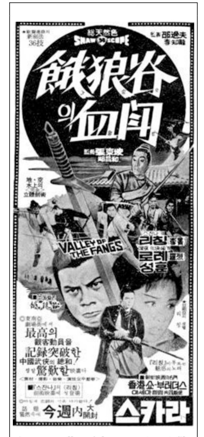
Figure 5. Valley of the Fangs (1970) film

production contracts lasted until the early 1980s. <sup>56</sup> Sometimes, a short scene with a random Korean actor was inserted into a film, as in the Shaw Brothers' Monkey Goes West (1966) and Valley of the Fangs (1970) - in order to give some semblance of a coproduction.