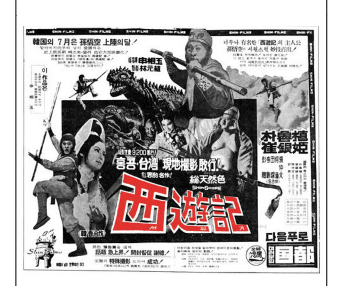
Figure 4. Monkey Goes West (1966) film advertisement from Gyeonghyang Daily 8 August 1966: 8. This Shaw Brothers' production made under the direction of Ho Meng-hua was falsely presented to audiences in Korea by Shin Film as a coproduction co-directed by Im Won-sik.

Spurred by the big profits to be made, illegal import agencies became very active, purchasing import licenses from registered producers for 3 to 6 million won (between approximately USD$23,000 and USD$46,000) each and then negotiating with American film distributors (based in Japan) on their behalf.<sup>52</sup>