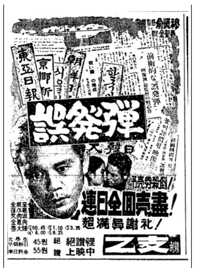
Figure 2. Obaltan film advertisement from Donga Daily 21 October 1963: 4. Obaltan is director Yu Hyun-mok's most well-known film. Yu used montage and sound effects as a medium to capture the run-down post-war Korean society. At the time of its release, the film was considered to be a watershed in Korean cinema for its rare attempt to capture a realistic picture of Korea (Chosun Daily 28 April 1961: 4) - that is, the theme, mise-en-scène, and visual style of 'aesthetics of devastation', while other films, mostly melodramas, had little reference to real life.

Almost immediately, the film industry, which was experiencing a new-found creativity since the end of the Japanese colonial period (1910-1945) with accomplished artfilms such as Yu Hyun-mok's Obaltan/Aimless Bullet (1960; see Figure 2), was reduced - both literally and figuratively - to the status of a propaganda factory in which all productions were classed as either "hard" or "soft" propaganda. They were to become key tools in what one critic described as "campaigns of assault" and "campaigns of assistance" respectively. 11 The regime achieved these aims first by consolidating the number of feature film production companies from 76 to 16 in 1961 and then by launching two new initiatives.