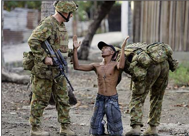
Australian peace keepers in action in East Timor

Australian insistence that it remain in charge of the security force outside of a Blue Helmet UN mission would later backfire, as Australians themselves subsequently became a target of hostility by supporters of victims of East Timorese casualties by Australian Defense Forces. Their number was 1,000 as of early 2007 (780 as of early 2008). On 8 April 2007, then Australian Foreign Minister Alexander Downer announced that Australia might be willing to transfer ownership of the security force to UN control after the June 2007 legislative elections. Still, that did not transpire. Quite the reverse, following the 11 February 2008 assassination bid against newly sworn in President Jose Ramos-Horta, the incoming Rudd Labor government actually expanded Australia's force commitment by 250 and has pledged a longer-term security commitment to the new nation. But even as the hunt proceeds for rebel holdouts, concerns of Australian interference or domination in the former Portuguese colony remain in the minds of many. [4]