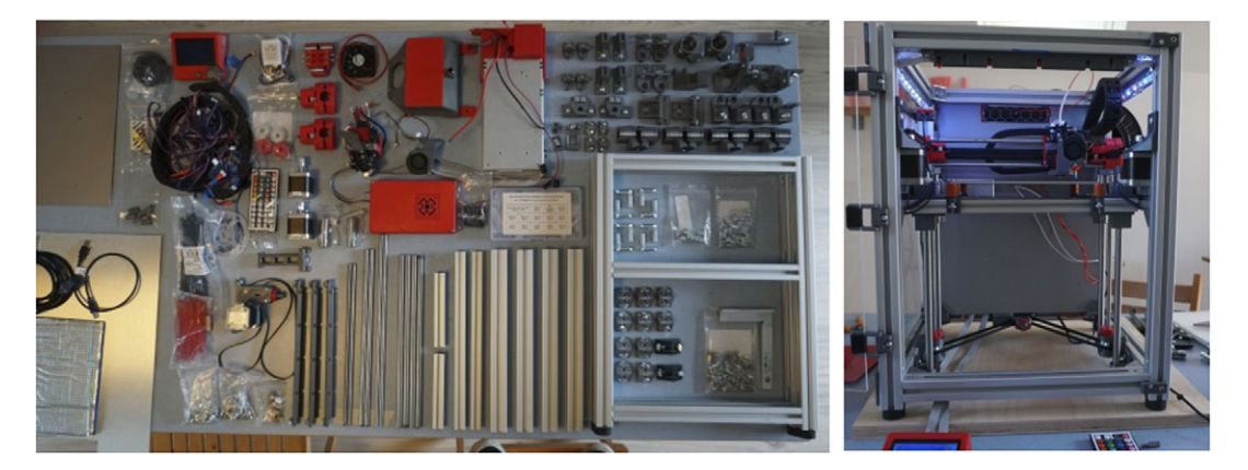
Figure 2. Left – All parts of the printer (prepared for assembly). Right – Fully assembled printer.

Following mechanical assembly, wiring the electrical components, along with soldering sensors and connectors, was necessary. Learning the required skills