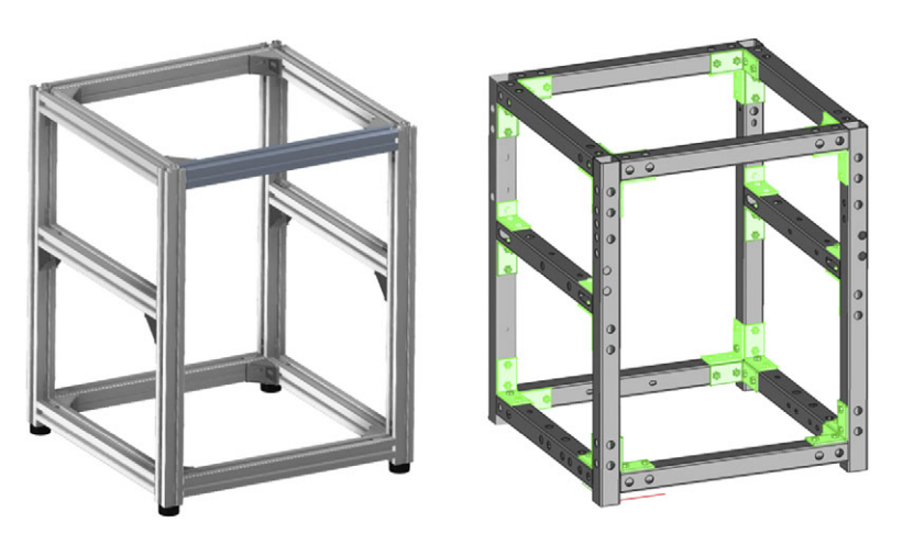
Figure 3. Left – Original aluminum profile frame. Right – Modified steel SHS frame with brackets.