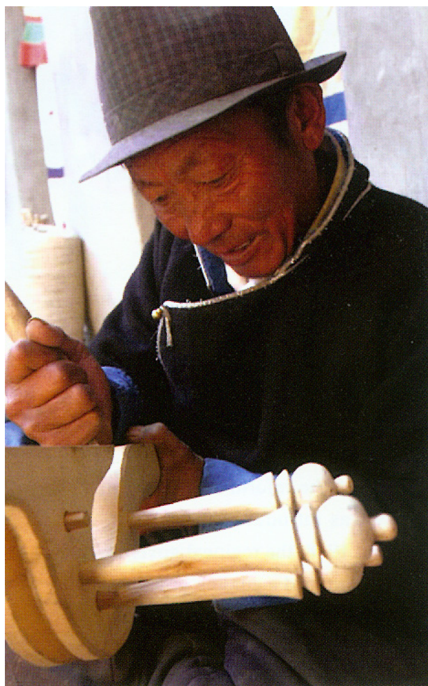
Tibetan artisan at work

confirms anecdotal evidence from local employers that Tibetans and other minorities can get jobs if they have the right skills.