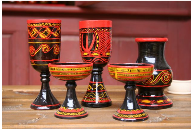
Crafts produced at the Eastern Tibet Training Institute

training, but only limited resources are allocated to it, especially in rural areas, and local governments are not given incentives to invest in it over the long term.