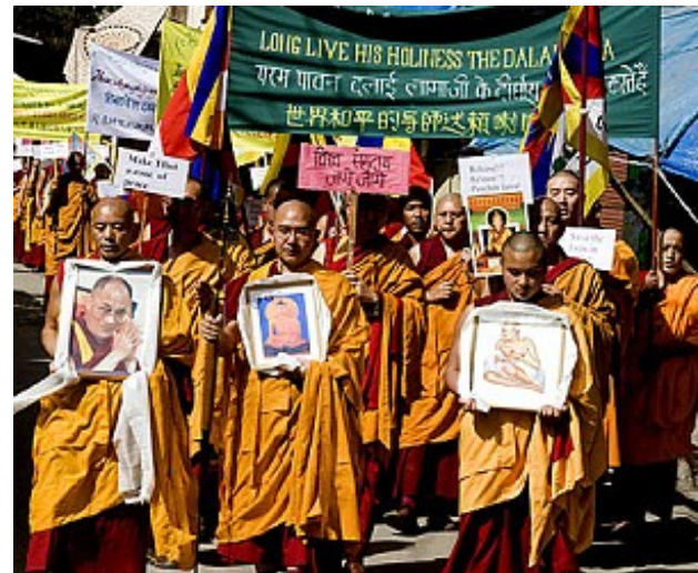
Tibetan monks in Dharamsala, India pray for demonstrators in Tibet, March 18, 2008

Certainly, Tibetan exile flags and "free Tibet" slogans were features of Tibet's biggest and most violent protests in decades, but it is simplistic to see the widespread discontent on the Tibet Plateau as a bid for freedom by an oppressed people. Protests in Lhasa began with Tibetan monks using the anniversary of the Dalai Lama's flight into exile (March 10, 1959) to peacefully demonstrate against tight religious controls, including patriotic education campaigns and forced denunciations of the Dalai Lama, but they were soon joined by ordinary Tibetans who used violence against non-Tibetans and their property. Victims included Muslim traders as well as Han Chinese.