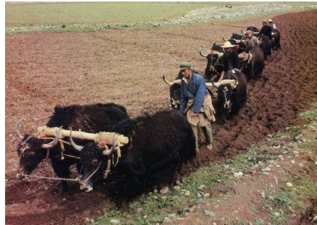
Tibetan farmers ploughing with yaks

Because of the rosy picture painted by official statistics and the state media, most Chinese are unaware that Tibetans have been among the big losers in the course of China's economic miracle, and that within Tibetan areas (both the Tibet Autonomous Region and Tibetan autonomous prefectures in the neighboring provinces of Qinghai, Gansu, and Sichuan), the pace of economic modernization has polarized Tibet's economy. While a minority of Tibetans have been rewarded with state jobs, the majority of Tibetans, who are poorly equipped to access new economic opportunities, have been marginalized.