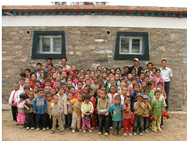
Tibetan school children at Jiangjia. School reconstructed with Finnish funds

A central problem is the high rate of illiteracy among Tibetans. While rates vary between the TAR and other Tibetan prefectures, and between urban and rural areas, ethnic Tibetans remain among the most illiterate in China. While enrolments have been rising, only a small minority of the total Tibetan population has some degree of secondary education. The national curriculum is highly academic, demands strong Chinese literacy, and is poorly adapted to rural and regional labor market needs. High school drop-out rates reflect the grim reality that investment in education is not rewarded by jobs, except for a tiny elite that are clever enough to continue to university and state jobs. More than 40% of Tibetans have no formal schooling at all, compared with China's national average of 8%. [4]