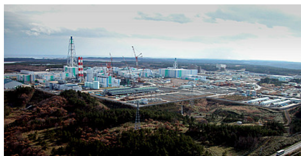
Rokkasho nuclear processing plant

These schemes are being fiercely resisted. Over 810,000 people, for example, have signed a petition demanding a ban on radioactive releases from Rokkasho. But such criticism, and the decision of some countries such as Germany to scrap nuclear energy will not affect Japan's march to the future, insists the Ministry. "Each country has its own conditions in formulating energy policy. Nuclear power remains important for us," said an official. METI believes that Japan's decision to stick with this policy, despite a string of scandals, huge cost overruns, the high price of nuclear power and unresolved problems of waste disposal may be about to pay off.