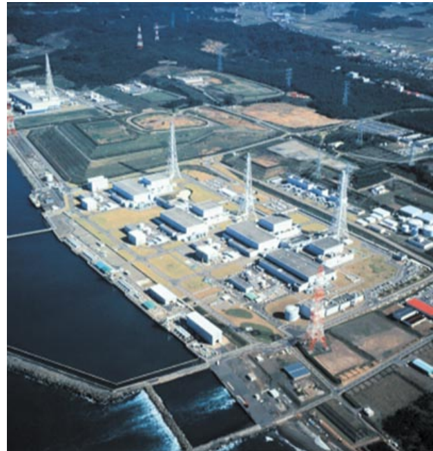
Kashiwazaki, since 1997 the world's largest nuclear power plant

The nuclear-first strategy has also survived a series of deadly blunders, including an accident at the Mihama Nuclear Power Plant in Fukui Prefecture two years ago that killed four, and the discovery last year of an earthquake fault close to the world's largest nuclear-power complex in Kashiwazaki-Kariwa. The complex remains closed.