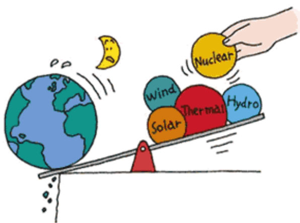
Power lobby illustration promoting nuclear power

Out of the thick political fog produced by Japan's G8 Summit in Hokkaido emerged one key pledge: the world's second-largest economy has announced a 60-80 percent cut in greenhouse gases by 2050, one of the most ambitious national targets. The pledge has since come under intense scrutiny, particularly over the telling lack of mid-term targets and deliberate fudging on the starting or base year for cuts – 1990 or 2008? But one thing remains very clear: nuclear energy will shoulder much of the burden of the country's climate-change strategy.