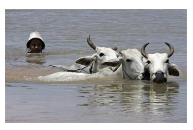
A woman guides bulls to higher ground in the Mekong near Phnom Penh

The larger cost has been diplomatic, as downstream neighbors suspect rightly or wrongly that Chinese dams were primarily responsible for the flooding. From the hard-hit Chiang Saen and Chiang Khong districts of Thailand's northern Chiang Rai province to its eastern Mukdahan province, many Thais believe waters released from the reservoirs of three upstream Chinese dams swelled the runoff from heavy rainfalls. They also blame China's recent blasting and dredging of upstream river rapids to make the river navigable for large cargo vessels for rising water levels.