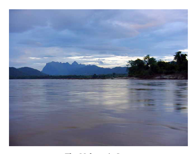
The Mekong in Laos

CHIANG MAI - As Mekong River floodwaters in Laos and Thailand recede, indignation with China for its lack of transparency on upstream dam developments is on the rise. China has recently pursued a friendly policy of economic integration with Southeast Asian neighbors but in relation to Mekong River development it has taken what many see as a covetous and less than neighborly approach.