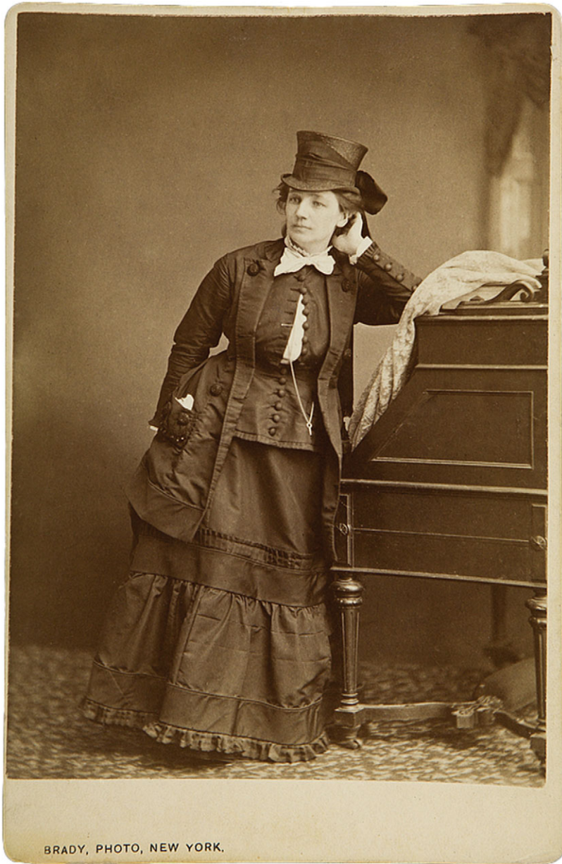
Figure 5. Mathew Brady, Victoria Woodhull, photograph, 1865–1873.

open around her breasts, which seems to subtly suggest that she borrowed this item from a man's closet. A light-colored bow at her throat adds to the dress's suit-like appearance. Her chain might be linked to a pocket watch, suggesting that her time matters. Woodhull leans against a wooden desk to demonstrate her preference for work