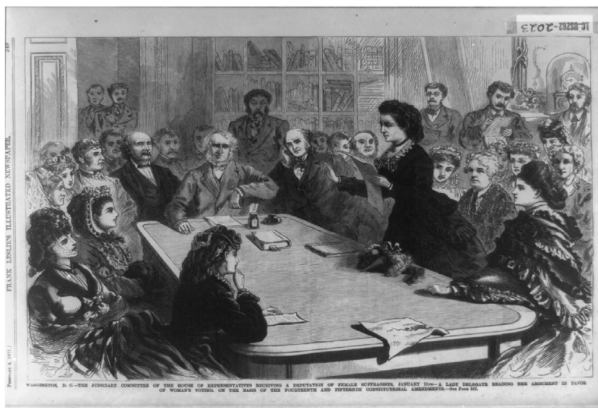
Figure 6. "Washington, D.C. The Judiciary Committee of the House of Representatives receiving a deputation of female suffragists, January 11th – a lady delegate reading her argument in favor of woman's voting, on the basis of the Fourteenth and Fifteenth Constitutional Amendments," Frank Leslie's Illustrated Newspaper , February 4, 1871, Library of Congress Prints and Photographs Division, Washington, D.C. Digital ID: ppmsca 58145 //hdl.loc.gov/loc.pnp/ppmsca.58145

mate, albeit without his knowledge or consent. The pairing of a white woman with a Black man likely sparked popular anxiety about the rise of interracial relationships in the post-Civil War era, and Woodhull's promotion of free love likely only increased that fear. Though she was officially too young to be president, Woodhull's run won more fame for her free love ideology, women's rights activism, and nontraditional gender norms.