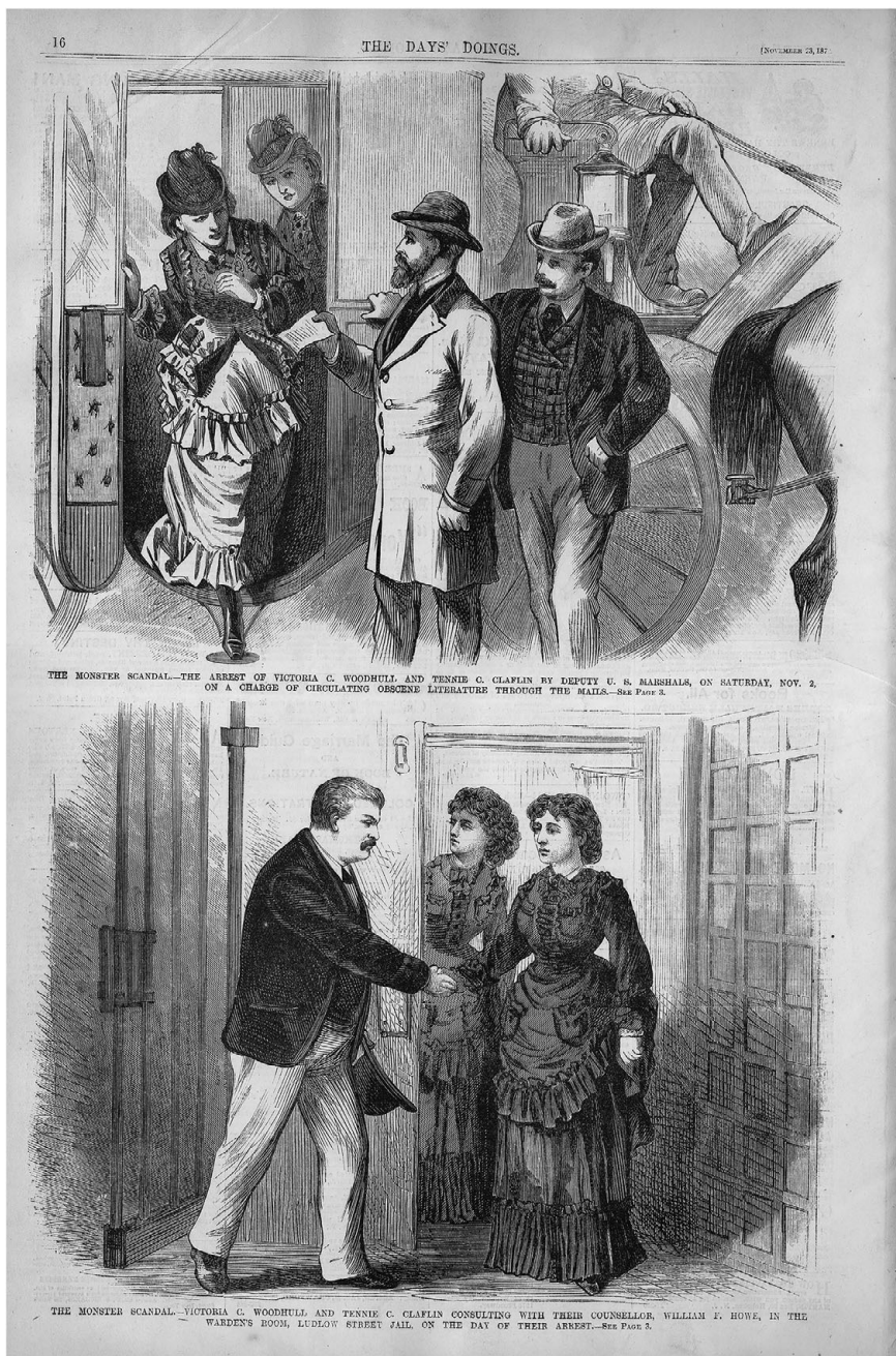
Figure 7. "The Monster Scandal," The Days' Doings , November 23, 1872, Library of Congress. https://lcn.loc.gov/unk81056776