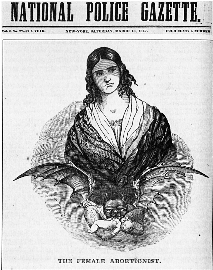
Figure 3. "The Female Abortionist," National Police Gazette , March 13, 1847.

While Nast might have seen Woodhull himself, to make his engraving he most likely viewed or purchased a photographic portrait of her at a local gallery. By the 1870s, photographs of famous figures were widespread, and engravings of them needed to be recognizable. A portrait taken by William Howell might have inspired Nast (Figure 4). Woodhull visited the photographer's New York City studio around 1865 to pose for this relatively traditional portrait. Wearing an elaborately pleated cloak, she looks in the distance and appears to ponder the future, similar to portraits of the day's male leaders. In this near-profile view, her bulky hairstyle stands out, echoing the curve of her ear. If Nast saw this photograph, her centered pair of set curls might have inspired her similarly shaped horns in his cartoon.