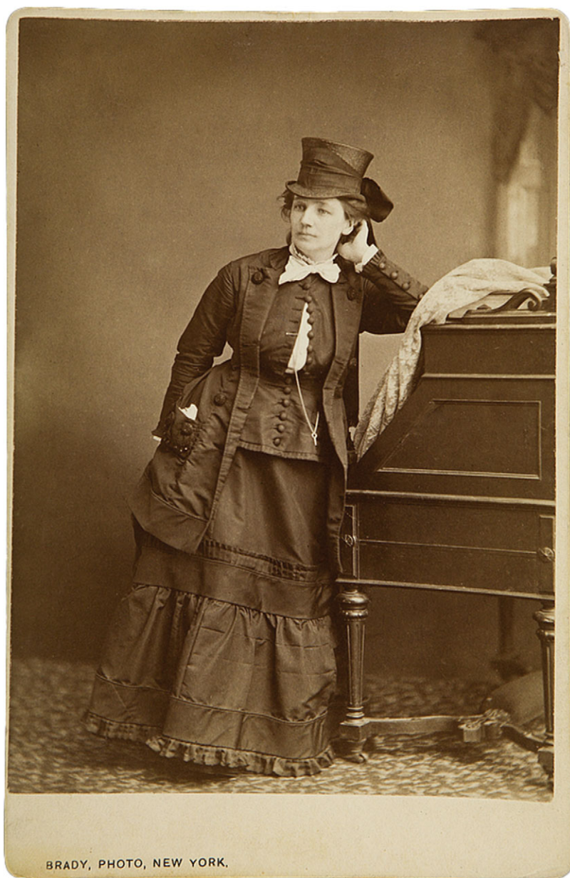
Figure 5. Mathew Brady, Victoria Woodhull, photograph, 1865–1873.

open around her breasts, which seems to subtly suggest that she borrowed this item from a man's closet. A light-colored bow at her throat adds to the dress's suit-like appearance. Her chain might be linked to a pocket watch, suggesting that her time matters. Woodhull leans against a wooden desk to demonstrate her preference for work