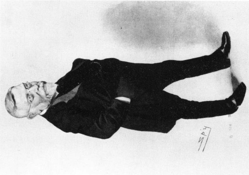
Plate 3: Barlow as royal physician. Offset lithograph after 'Spy', published in a supplement to Vanity Fair , 12 April 1906. Appointed a physician to the royal household in 1896, Barlow subsequently served as Physician-Extraordinary to three successive sovereigns.