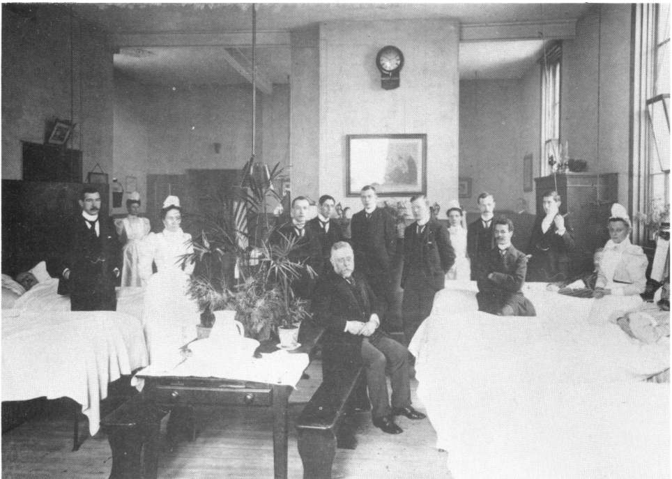
Plate 2: Barlow (seated, centre) with students, nurses and patients at University College Hospital, c. 1900. Barlow was on the staff of the Hospital from 1880 to 1910. (BAR P/1/2, Wellcome Institute Library.)