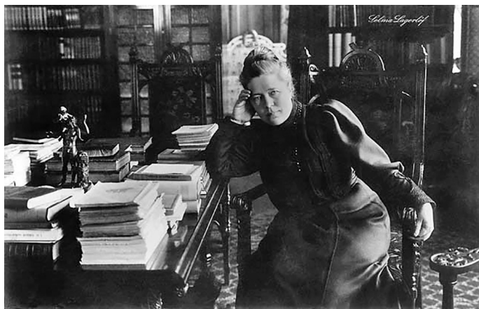
FIGURE 2.1 Selma Lagerlöf, Nobel Prize-winning author and early conservationist, at her desk while writing Nils Holgersson in the early 1900s.

member of the entire population of Sweden could possibly find anything lacking in such a richly endowed country that was surely a gift from some higher authority. Could any nation be better?