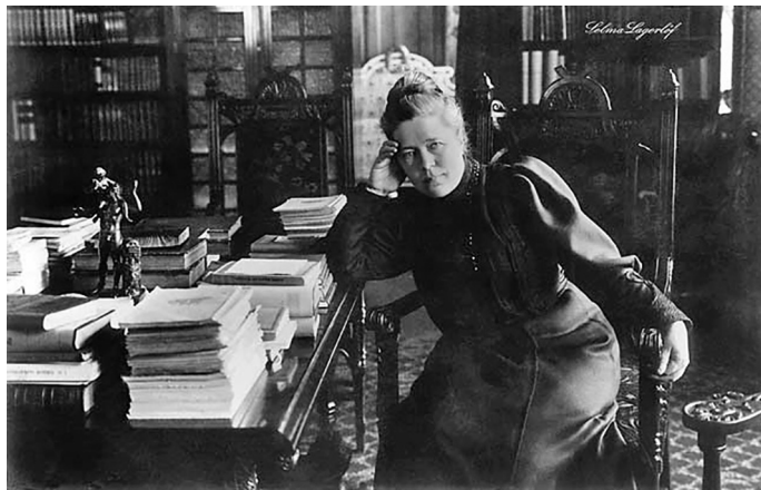
FIGURE 2.1 Selma Lagerlöf, Nobel Prize-winning author and early conservationist, at her desk while writing Nils Holgersson in the early 1900s.

member of the entire population of Sweden could possibly find anything lacking in such a richly endowed country that was surely a gift from some higher authority. Could any nation be better?