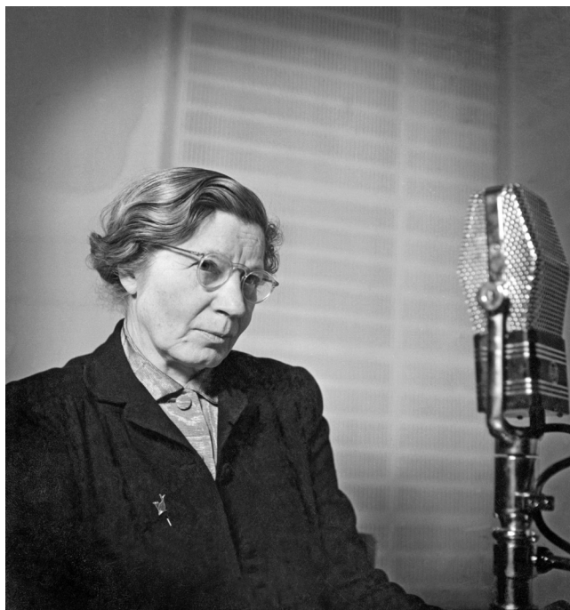
FIGURE 2.2 Elin Wägner, early feminist with ecological ideas. Her anti-war pamphlet Väckarklocka [Alarm Clock] (1941) is generally considered Sweden's first articulation of a program for a responsible lifestyle that cared for the qualities of unspoiled nature and home-grown food.

critique of the misconstrued economy and norms of modern, militaristic society. A central theme in both books were issues that would be called “environmental”: resource waste, pollution, food security, erosion, and decaying soils.