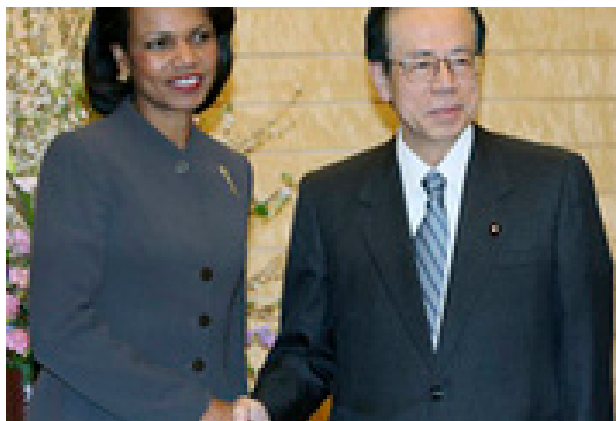
Secretary of State Rice expressed "regret" in meeting with Prime Minister Fukuda

Occasionally the remorse goes up to the Pacific commander-in-chief or, in the most recent case, to the secretary of state. On February 27, Condoleezza Rice said, "Our concern is for the girl and her family. We really, really deeply regret it." The various officers responsible for the discipline of US troops in Japan invariably promise to tighten supervision over them, who currently number 92,491, including civilian employees and dependents. But nothing ever changes. Why?