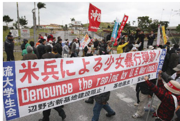
Okinawan protest at Marine Headquarters in Kita Nakagusuku village following news of the rape

Once an incident "blows over", as this latest one now has, the pundits and diplomats go back to their boiler-plate pronouncements about the "long-standing and strong alliance" (Rice in Tokyo), about how Japan is an advanced democracy (although it has been ruled by the same political party since 1949 except for a few years after the collapse of the Soviet Union), and about how indispensable America's empire of over 800 military bases in other people's countries is to the maintenance of peace and security.