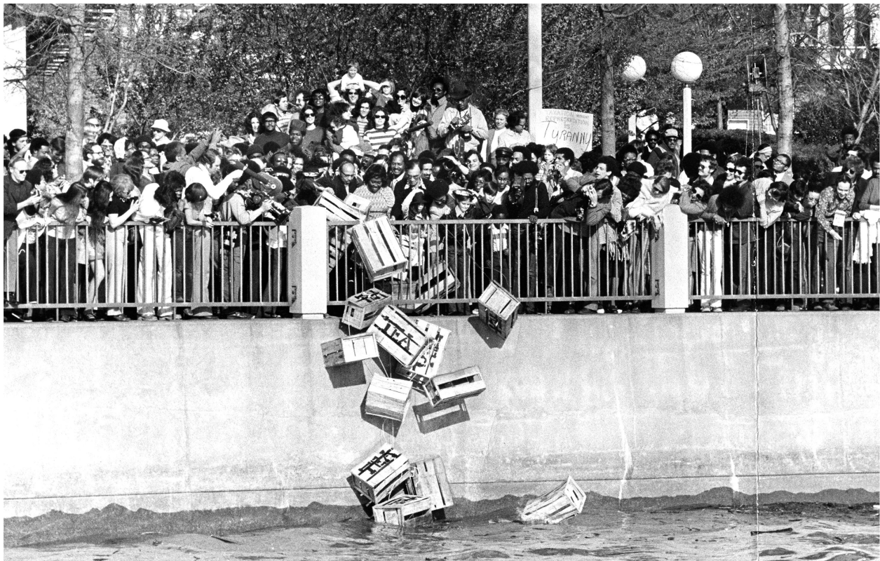
Figure 3 Members of Self Determination for D.C. dump tea crates into the Potomac River, 1973