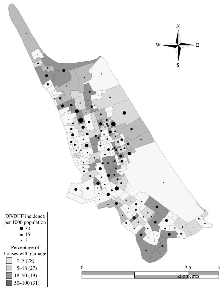
Fig. 4. DF/DHF incidence/1000 population and percentage of houses with garbage in Songkhla municipality ( r=0.43 , P=0.001 ).

block clustering was not statistically significant in this study for some or all of the following reasons. First, risk factors such as those relating to the Breteau index, shop-houses, brick-made houses and houses with poor garbage disposal were found to have no clustering. Second, in this small business city the population is relatively mobile and the children frequently wander freely from house to house, thus the exposure to the infective mosquitoes can be quite homogeneous. Third, the incidence within each block might not be high enough to demonstrate any significant correlation. Thus, it would be more effective to test the hypothesis of housing factors on a larger scale.