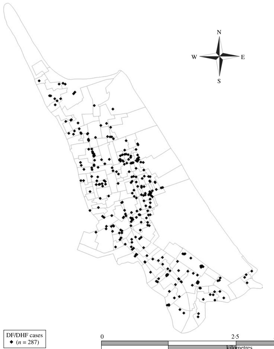
Fig. 1. Distribution of DF/DHF cases in Songkhla municipality (nearest-neighbour analysis Z = -8.03 , P < 0.0001 ).