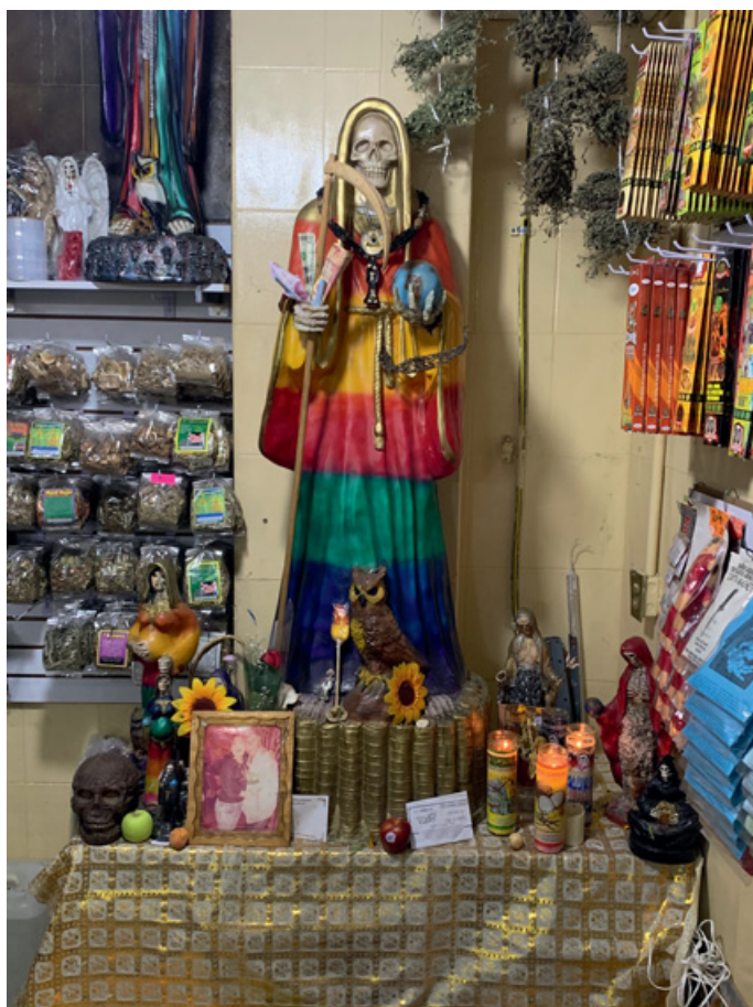
Figure 4 The multicoloured ‘seven powers’ Santa Muerte, Juárez market, Monterrey.

heart, a gold-coloured one for financial fortune, a green one for legal matters, amber for physical and mental health, and blue for professional well-being and wisdom. An entirely white figurine represents purification and is employed to discharge negative energies. The black Santa Muerte allegedly provides total protection, but some turn to her to inflict harm on others. Since devotees often face assorted challenges, the multicoloured Santa Muerte statue – known as the ‘seven powers’ – has become very popular (Figure 4). Colours are meant to steer Santa Muerte’s force in desired directions. 6 Some statues are painted with