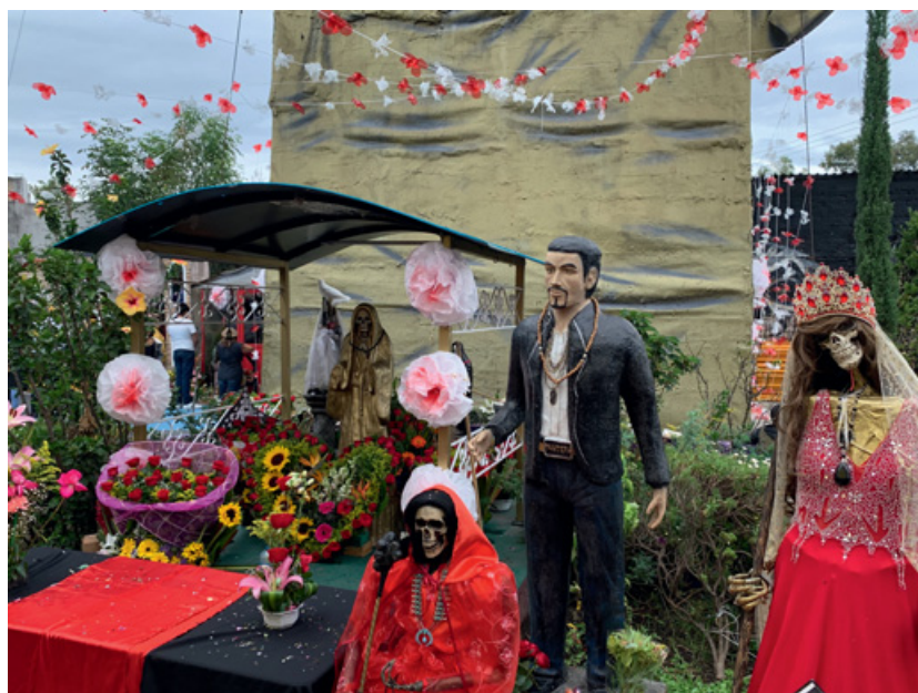
Figure 8 Comandante Pantera effigy at the Tultitlán shrine.