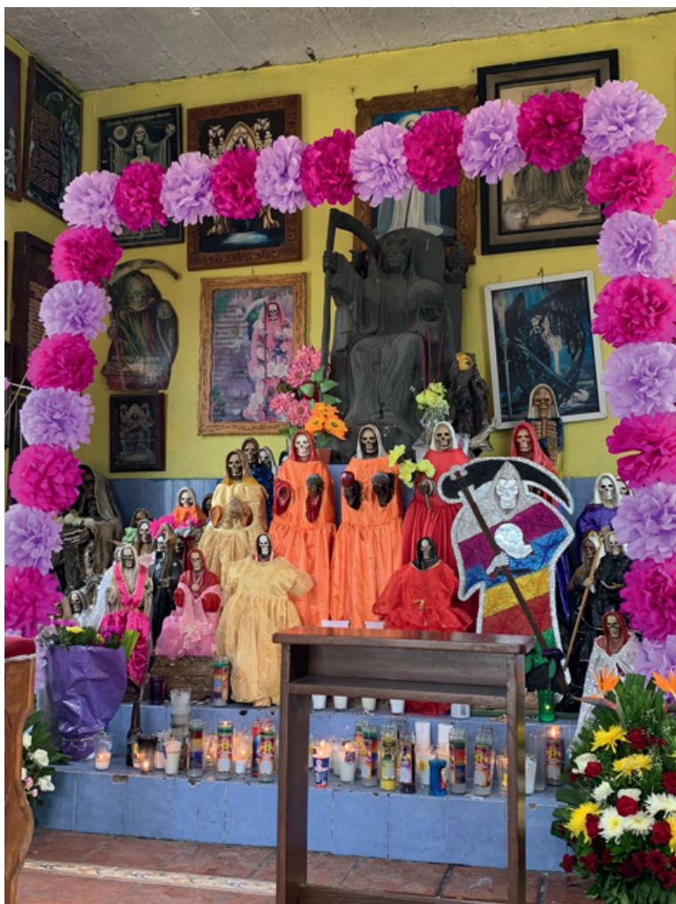
Figure 1 Altar in Capilla de la Santa Muerte, El Huizache junction, San Luis Potosí.

Several human-sized dressed statues line the yellow inner walls, which are covered with large, framed Santa Muerte posters. Some have photographs stuck on them of the devotees requesting Santa Muerte's protection. Unsurprisingly, quite a few are truck drivers, who spend weeks on the road away from loved ones, living on junk food and pills, risking accidents, robberies, or worse. A spectacular example of a tailor-made poster contains a Santa Muerte image on top of which a cut-out photograph of a chauffeur in front of his double truck is glued. The skeletal saint wears a white robe, her grisly skull, surrounded by an aureole, looks down on the driver. Underneath the image is a prayer. The