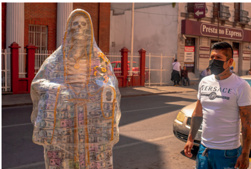
Figure 3 Statue of Santa Muerte, near Juárez market, in Monterrey.

If today's devotees decide to acquire a Santa Muerte figurine, they can choose from a bewildering supply of designs, sizes, colours, materials, and scenes. Well-stocked esoteric market stalls make up a trove of visual exuberance and symbolic enjoyment. This section examines the main features of Santa Muerte material culture and argues that its vibrancy and expressive diversity is propelled by grassroots devotional agency. It specifically looks at how statue designs, gender identity, and tattooing are related to the creative diversification and personalization of devotion. After that, it focuses on different places of devotion, and the services offered. Most attention goes to physical altars and shrines, but online space is also considered.