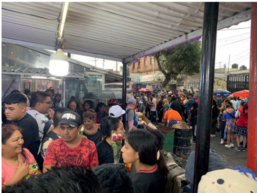
Figure 6 Devotees lining up and leaving Santa Muerte shrine before start of monthly rosary at Alfarrería street, Mexico City.