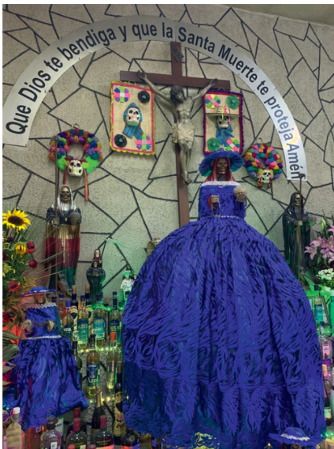
Figure 7 Main Santa Muerte statue at 1er. Santuario a Dios y La Santa Muerte, Puebla.