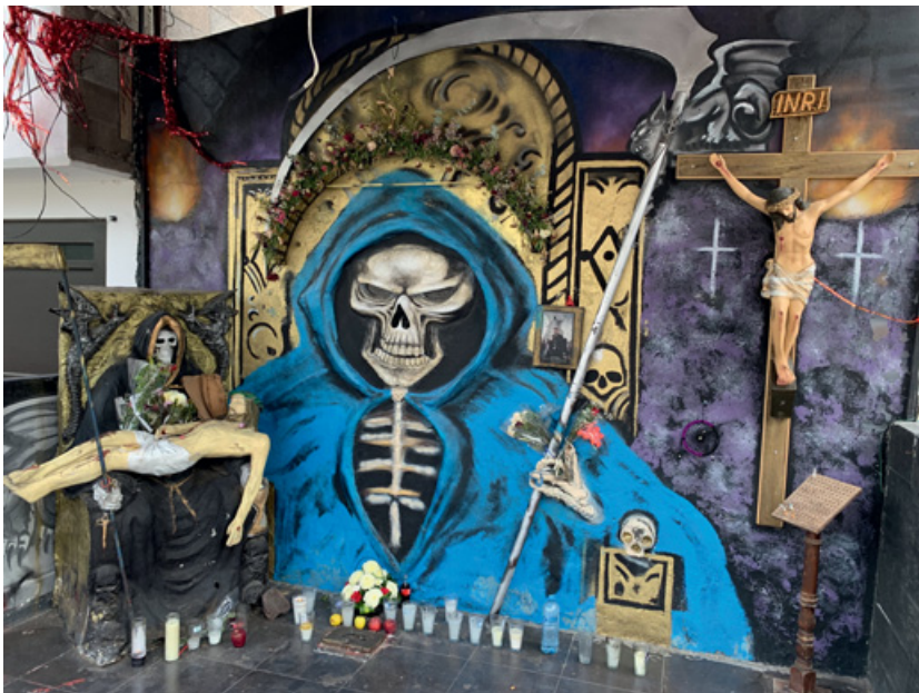
Figure 5 ‘Pietà’ Santa Muerte, San Luis Potosí.

A final layer of Santa Muerte’s iconographic lavishness is added by dressing up prefabricated statuettes. Building upon a long Catholic tradition to dress female saints during festive occasions, Santa Muerte devotees may decorate their images with gowns, jewellery, and wigs. For example, the main figure in doña Enriqueta Romero’s famous shrine in Mexico City is renowned for her collection of gowns and excessively long hair. The acquisition of dresses or wigs is a way to express devotees’ gratitude for a particular saintly intervention – or to formulate