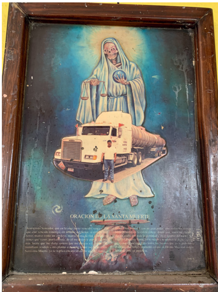
Figure 2 Santa Muerte poster, Capilla de la Santa Muerte, El Huizache junction, San Luis Potosí.

Elsewhere in the shrine is a wooden display case full of small passport pictures and IDs, and photographs of more truck drivers, couples, families, and children. At the bottom of the display case are some Santa Muerte figurines, and a replica skull open at the top, in which someone has put out a cigarette.