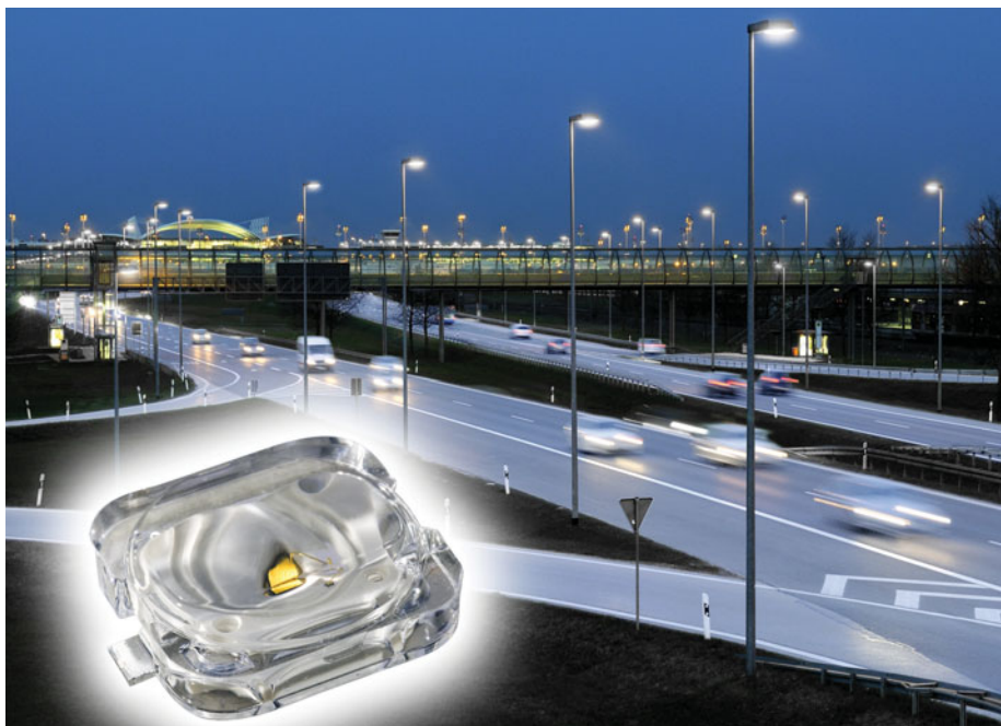
Lighting up roads with LEDs could save energy and cut maintenance costs while considerably reducing light pollution, since light is directed only on the area to be illuminated and not upward.

“You can create a baseline optical fingerprint for a room when it is lit with and without sun, morning versus afternoon,” Karlicek said. “When you walk into the room, the light flow is altered by your presence. Now you can potentially create a system where you do light sensing and create a notion of where light has to be on