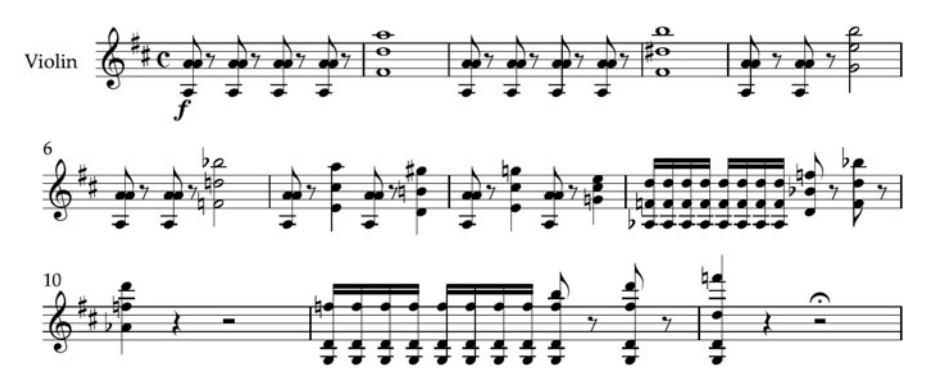
Ex. 1 Joachim's cadenza for Beethoven's Violin Concerto/i, bars 1–12

contrasts between these two forces almost approach the status of dialectical oppositions in this corpus, encompassing parameters such as divergent tonal orientations, formal functions, and sometimes rhetorical affect.<sup>32</sup>