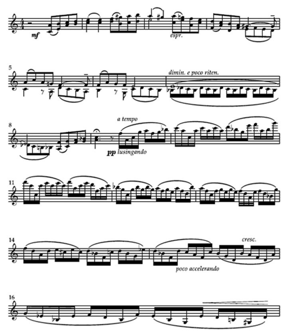
Ex. 10 Joachim's cadenza for Viotti's Violin Concerto No. 22 in A minor/i, bars 1-16

play an important role in Joachim's compositions. <sup>67</sup> The role of the flat submediant in Joachim's Viotti cadenza might even be described as tonal pairing, a nineteenth-century technique that combines the tonic with (usually) a third-related key. <sup>68</sup>