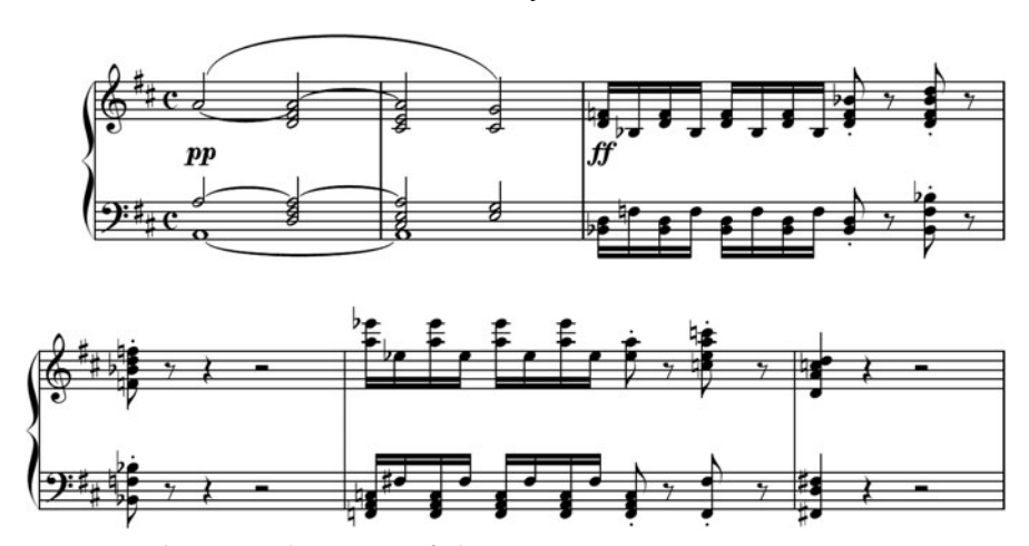
Ex. 2 Beethoven, Violin Concerto/i, bars 26-31

Joachim's use of these two chords is not coincidental: their juxtaposition may be heard as an analytical commentary on Beethoven's opening ritornello. Beethoven unexpectedly introduces D-sharp in bars 10 and 12, revisiting this pitch enharmonically as E-flat in bar 30. This return sets the stage for Beethoven's modulation to the flat submediant, B-flat major. As Timothy Cutler has observed, 'Beethoven explores not only the compositional possibilities of D-sharp but also its enharmonic equivalent, E-flat'<sup>35</sup> when the flat submediant arrives. This flat submediant appears in Joachim's cadenza, in which bars 9–10 cite the ritornello material from bars 28–33 in the Beethoven concerto. A sequential repetition follows on V/ \flat VII. This particular section of ritornello material is never performed by the soloist in the parent concerto. In fact, Beethoven contrasts this stormy outburst (Ex. 2) with the soloist's lyrical themes.