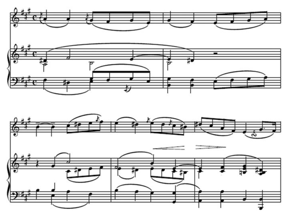
Ex. 8 Viotti, Violin Concerto No. 22 in A Minor/i, bars 127–31

subdominant-type tonality balances out an earlier dominant orientation, occurs frequently in eighteenth- and nineteenth-century recapitulations (though generally not in cadenzas). Charles Rosen remarks upon the 'force for resolution, an antidominant, in fact, and there is a tendency for the second half of a sonata to move toward the subdominant and other flat keys'. <sup>62</sup> Joachim imports this manoeuvre into the genre of the cadenza, endowing it with a recapitulatory power.