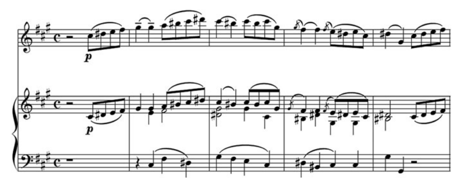
Ex. 9 Viotti, Violin Concerto No. 22 in A Minor/i, bars 220-224

other flat-side tonalities might have been influenced by Beethoven's Violin Concerto, whose first movement tonicizes the flat submediant in the ritornello passage discussed above.