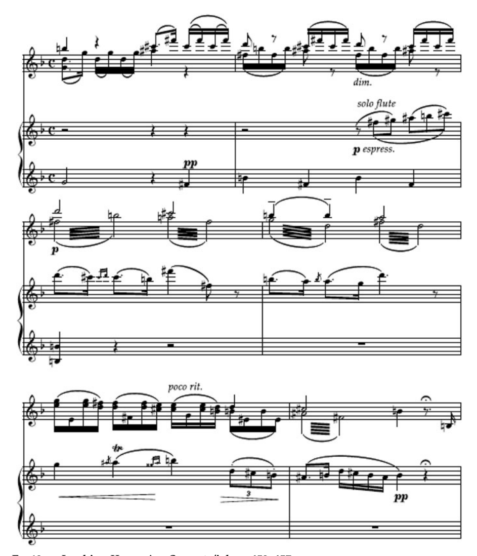
Ex. 13 Joachim, Hungarian Concerto/i, bars 452-457

the Mozartean cadenza (and, by extension, most eighteenth- and even nineteenth-century cadenzas) resemble a secondary development section, for 'most developments prolong the home-key dominant at a deep structural level, with other tonal regions emerging only through a strictly organized contrapuntal scheme within this dominant prolongation'. Insofar as cadenzas also tend to prolong the dominant, this shared tonal orientation links the cadenza and development section together.