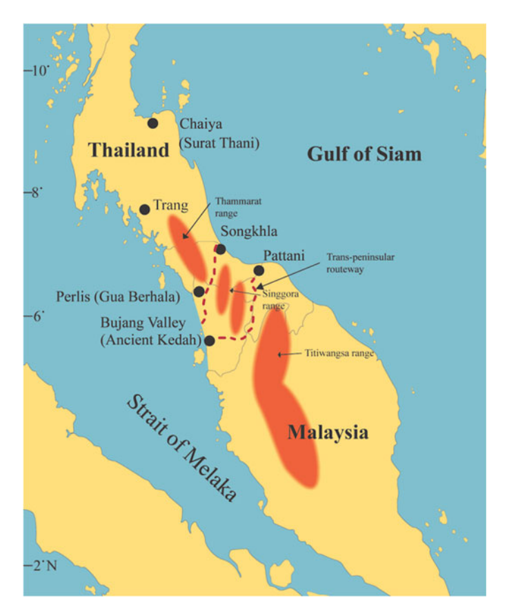
Figure 11. Malay—Thai Peninsula with archaeological site of Bujang Valley, and Gua Berhala in Perlis.

Thailand to the Gulf of Siam<sup>20</sup> and another one from northern Kedah via Perlis to Songkhla, tracking between the Thammarat and Kedah Singgora ranges (Figure 11).<sup>21</sup> Thus, the region was bustling with human activities, not only of commerce and trade, but also of culture as well as religious thought and practice. As such, Perlis, given its proximity to Bujang Valley and being one of the settlements of Ancient Kedah, might have actively participated in these exchanges in one way or another (more of this below).