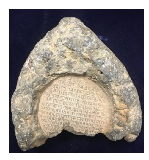
Figure 10. One of the three fragments of clay sealings stamped with the Bodhigarbhālankāralakṣa-dhāraṇī preserved at the Kota Kayang Museum in Perlis.

It was not until 2013 that Nasha Rodziadi Khaw and Mohd Mokhtar Saidin published the first reading of the inscription. As no single complete sealing was available to them, the reading is based on a collation of eight fragments of the tablets (which are reproduced in Figures 2 to 9). They found that the reading of this inscription resembles the textual content of certain sealings found in Hund, Pakistan. Unfortunately, the reading of the Hund sealings was incomplete due to the fragmental nature of the tablets and effaced characters. However, they managed to identify the reading as a certain <code>dhāraṇi</code>, similarly to other north Indian clay sealings preserved in the British Museum in London and in the Ashmolean Museum in Oxford through the work of Simon Lawson. Nevertheless, none of these papers was able to identify the <code>dhāraṇi</code>. But it has now become clear that the <code>dhāraṇi</code> that appears on the sealings of Perlis, Hund, and the British and Ashmolean Museums is the <code>Bodhigarbhālankāralakṣa-dhāraṇi</code> or the <code>dhāraṇi</code> of the Hundred Thousand Ornaments of the Essence of Awakening.