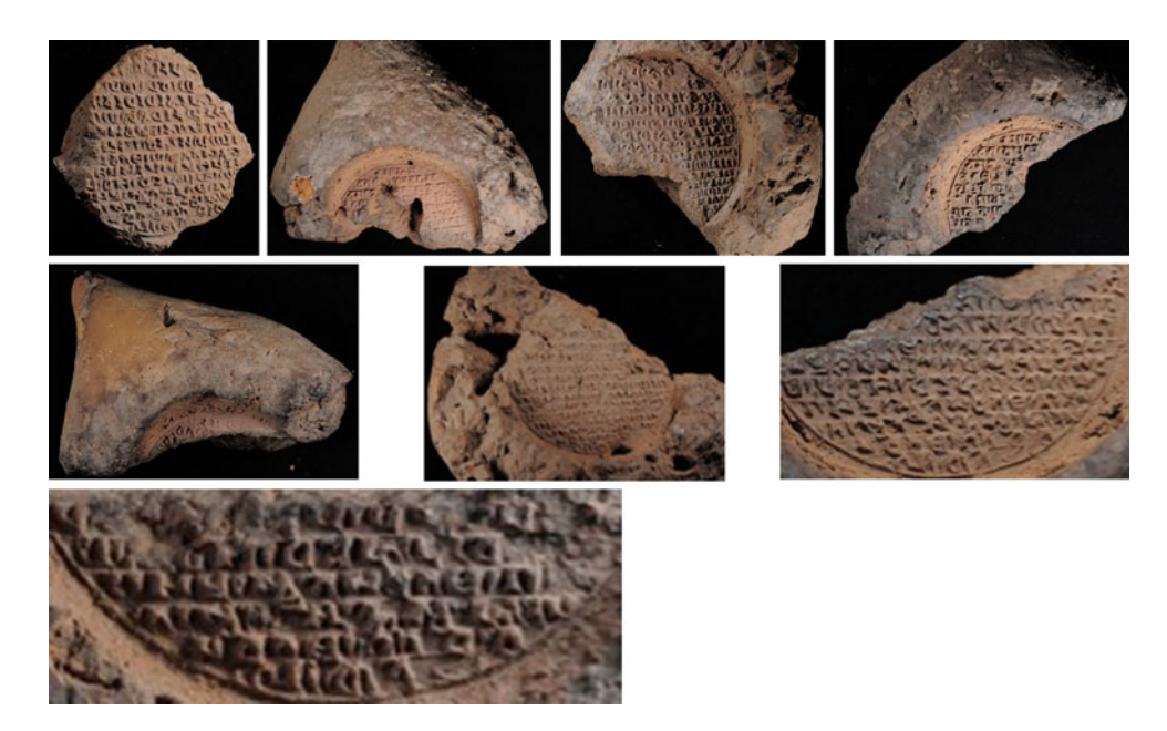
Figures 2 to 9. Fragments of clay sealings stamped with the Bodhigarbhālaṅkāralakṣa-dhāraṇ ī found in Gua Berhala in Perlis, Malaysia.