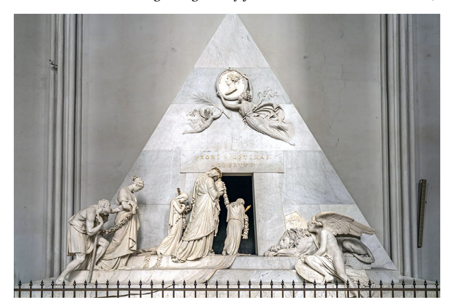
Figure 2.2 Antonio Canova, Cenotaph of Archduchess Maria Christina of Austria (1805). Church of St. Augustin, Vienna.

pain, which in the end becomes monotonous" ( C , p. 356). <sup>80</sup> Practically identical twins, the statues convey "only one idea, only one picture" ( C , p. 351). Hippolyte Taine's 1866 analysis of the "insipid or attitudinizing" figure on the tomb of Clement XIII highlights its modernism when he writes, "[t]he more a monument approaches our time the more do its statues assume a spiritualistic and pensive expression; the head usurps all the attention; the body is reduced, veiled, and becomes accessory and insignificant." Taine's observation echoes Oswald's reliance on abstraction – to the degree that he renders the material "insignificant." As I will show, Canova's statue forecasts Corinne's own debilitating sorrow, suggesting that modern grief has a contagious quality, one infecting the