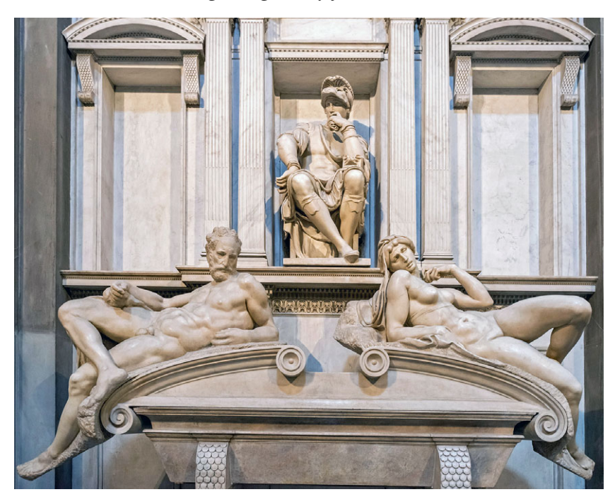
Figure 2.4 Michelangelo, Tomb of Lorenzo, Duke of Urbino , with figures of Dusk (l.) and Dawn (r.) (1519–1534). Cappelle Medicee, Church of San Lorenzo, Florence, Italy. <sup>84</sup>

live, while Michelangelo's urge her to anesthetize her senses and sacrifice her material vitality: