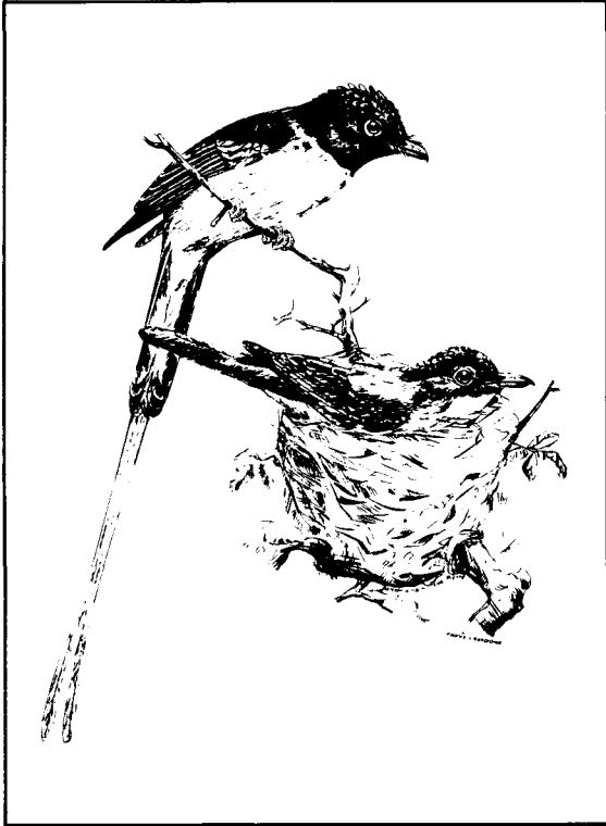
Madagascar paradise flycatcher (from Madagascar , published by Pergamon Press).

facilitate the exchange of information and expertise on the captive biology of Macaca silenus , to assess its conservation needs in the wild, and to formulate a programme of information exchange and co-operation to ensure the certain survival of this endangered primate.