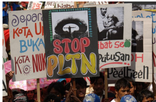
Rally followed the Ulama fatwa declaring the Muria site haram .

In June 2007, some 4,000 demonstrators against the project rallied at the central Javanese site, including a local chapter of Greenpeace. In October, 100 clerics and scholars from the largest Muslim organization in Indonesia, Nahdatul Ulama, descended on the site and, after deliberations, issued a fatwa declaring the Muria site haram or forbidden, albeit more on pragmatic than strictly religious grounds. [14]