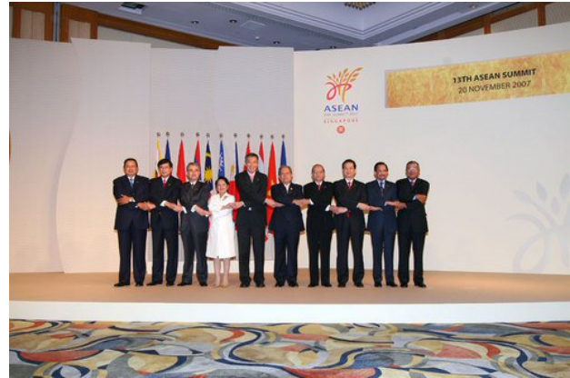
The 13th ASEAN Summit meeting held in Singapore in November 2007

The 2005-07 spike in petroleum prices topping out at $100 a barrel has prodded economic planners across the globe to reconsider their energy options in an age of growing concern over global warming and carbon emissions. The Southeast Asian economies, themselves beneficiaries of an oil and gas export bonanza through the 1970s-1990s, also find themselves in an energy crunch as once ample reserves run down and the search is on for new and cleaner energy supplies. Notably, regional leaders at the 13 th ASEAN Summit meeting held in Singapore in November 2007 issued a statement promoting civilian nuclear power, alongside renewable and alternative energy sources. ASEAN--which in 1971 endorsed a nuclear-free zone concept--also sought to ensure that plutonium did not fall into the wrong hands through the creation of a "regional nuclear safety regime." In response, environmental activists across the region cited concerns over nuclear power, citing safety and unstable regional geologies concerns. [1] Undoubtedly they were taking a cue from Japan's recent nuclear disaster. [2] Singapore, host of the ASEAN summit meeting, made known its concerns.