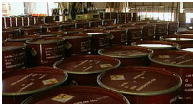
Indonesia plans to expand its fledgling nuclear industry

processing and conversion. Its nuclear research program spans five decades. Three research reactors are in operation with a fourth planned. Indonesia hosts at least two uranium mines capable of supplying sufficient yellowcake to service domestic needs for planned reactors. While Indonesia operates under IAEA safeguards, SIPRI's stated concern is that given the questionable security of the management of nuclear waste, "it is conceivable that terrorist organizations could utilize its spent waste in a radiological device ("dirty bomb"). [15] Perhaps of greater concern is the combination of unstable geological conditions and dubious safeguards to control the technology.