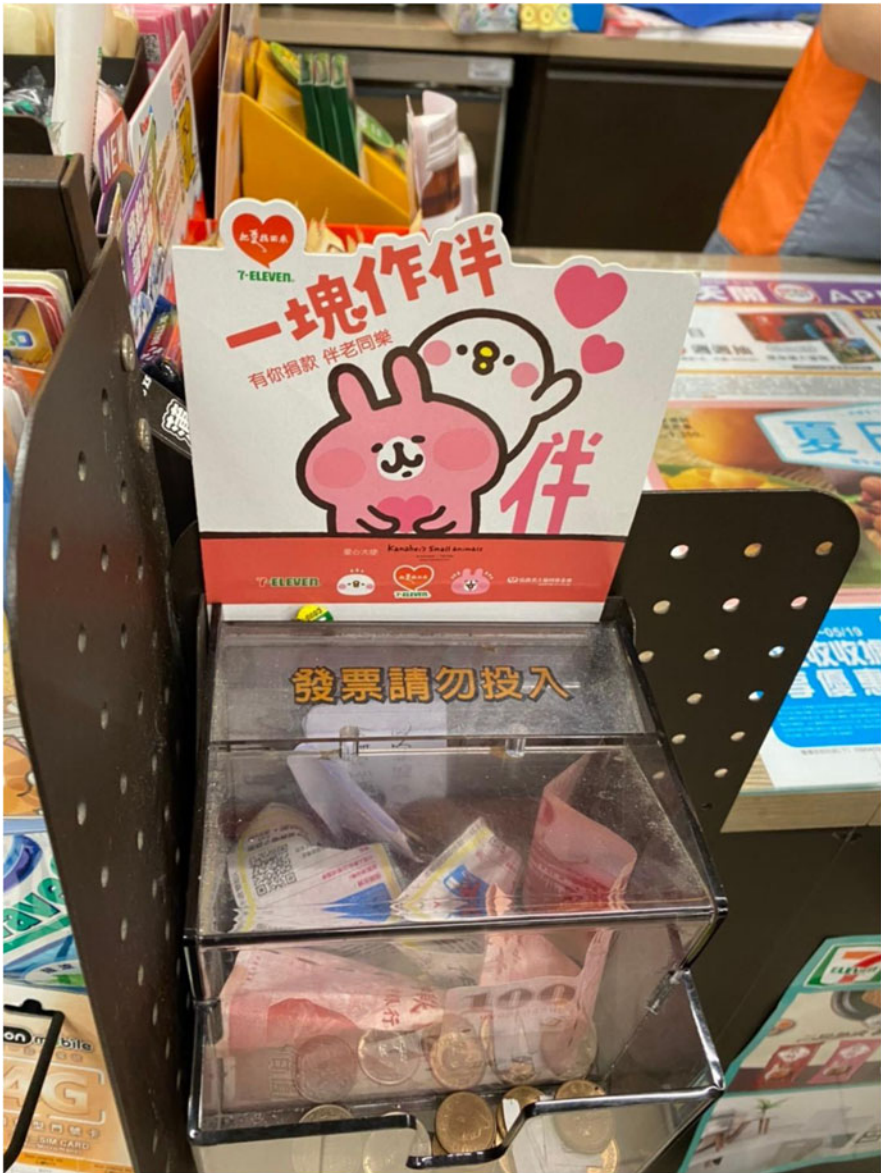
Figure 5. A donation box for cash at the counter of a convenience store noting “Not for GUIs”.

in the world, imposing a certain full-fledged skepticism on the population in N would still be counted as relatively moderate. But presumably, this conclusion is implausible.