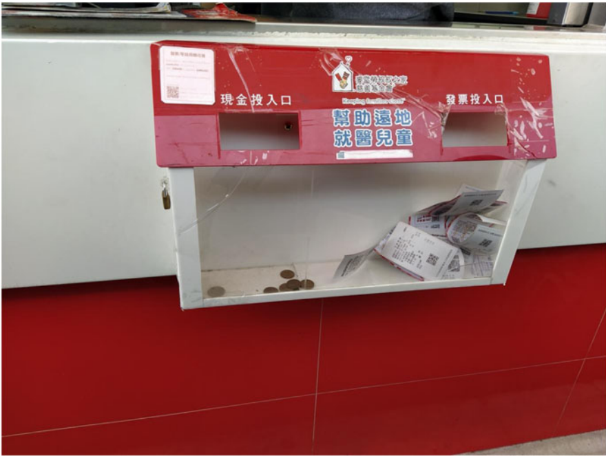
Figure 2. A donation box for cash and GUIs in front of a drive-through window.

people to have relevant evidence indicating that others are lottery-ticket holders, etc. But then it is also fair to say that it is not common for ordinary people to suffer from the Harman-style skepticism. So, might proponents of the no-justification account discard the strong contention that it is uncommon for the Harman-style skepticism to arise and opt for the weak contention that it is not common for the Harman-style skepticism to arise?