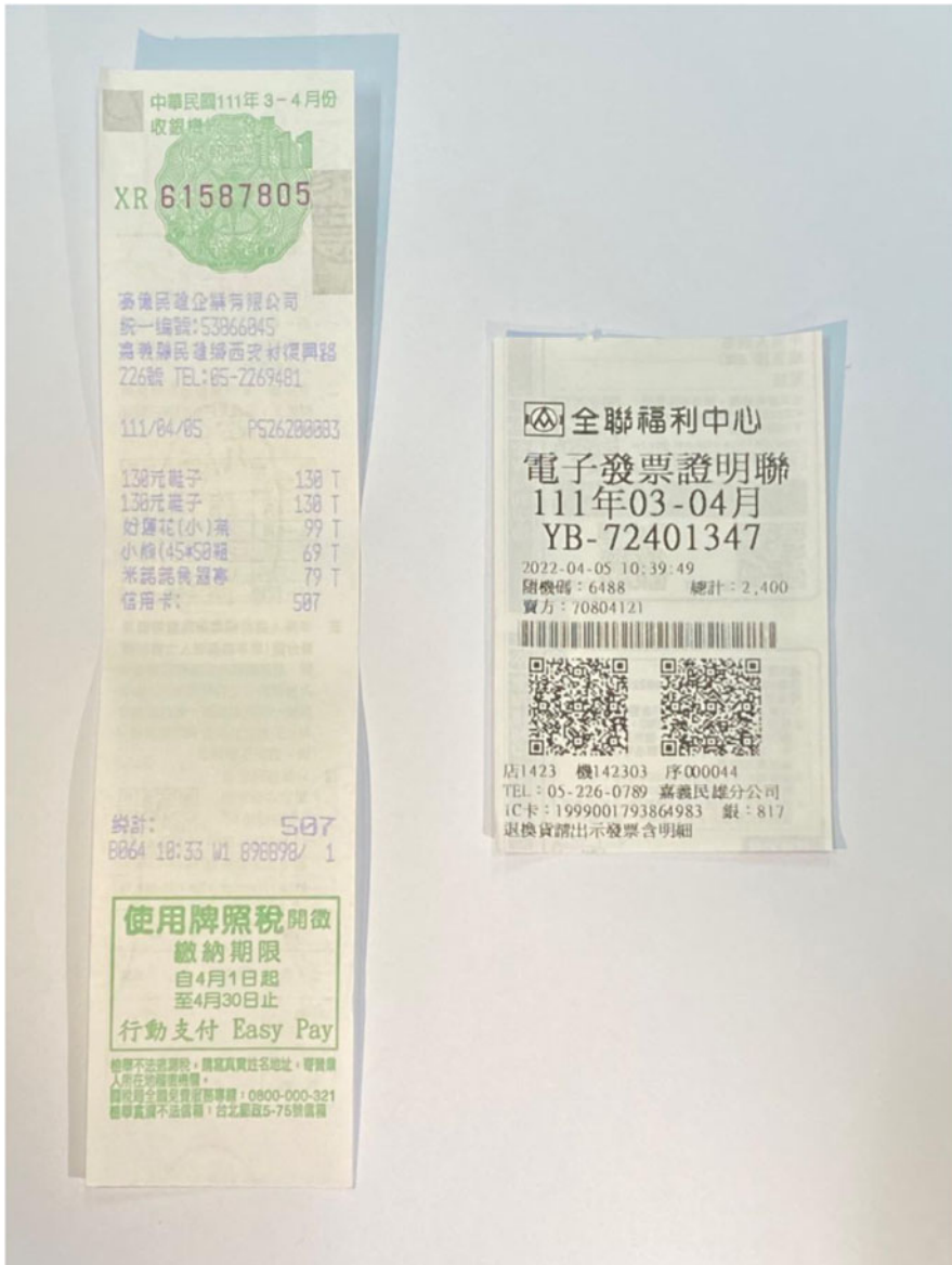
Figure 1. Two formats of GUIs.

(roughly US$1,300), 10,000 TWD (roughly US$313), 4,000 TWD (roughly US$136), 1,000 TWD (roughly US$31), and 200 TWD (roughly US$7), respectively. 8