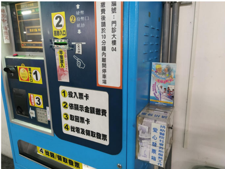
Figure 4. A donation box for GUIs attached to an automatic parking ticket machine.

are facing a theoretical problem, not a practical one. René Descartes has noted that his epistemic project is not concerned with “action but merely the acquisition of knowledge” (Descartes 1984: 2:15). I should say the same here. The problem facing the no-justification account is not that the view has implications that, for all practical purposes, greatly affect the ordinary lives of the Taiwanese. The problem, rather, is that imposing the Harman-style skepticism on the Taiwanese is theoretically implausible (I will say more about this point in the next section).