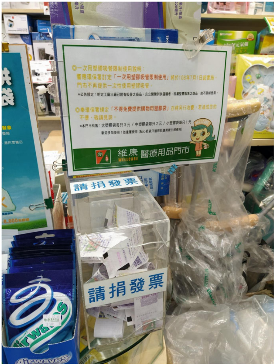
Figure 3. A donation box for GUIs at the counter of a pharmacy store.

that Mary will very likely be in New York tomorrow. For instance, Bill can still plan to meet with Mary in New York tomorrow. So, could we say that imposing the Harman-style skepticism on the Taiwanese is not totally unacceptable, since the skeptical result is not debilitating?