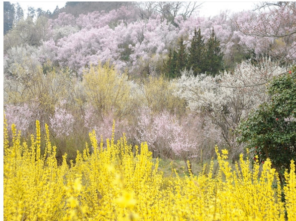
Viewing cherry blossoms.