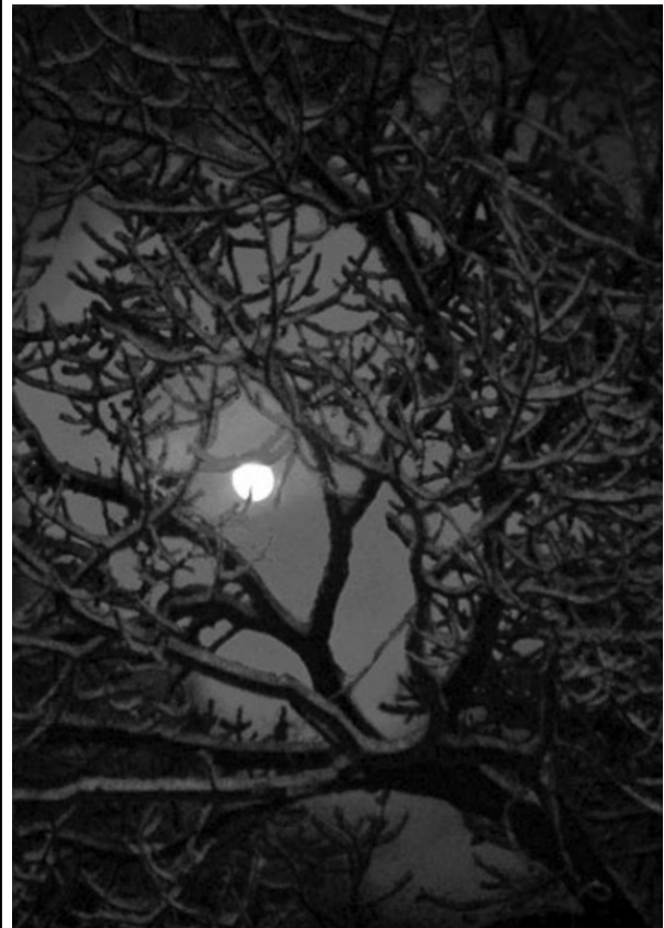
"Elf's Forest."