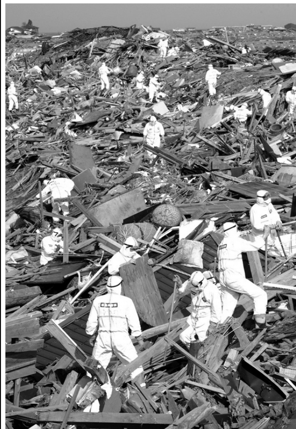
300 Policemen in NBC Suits Search Victims Near Namie Town.