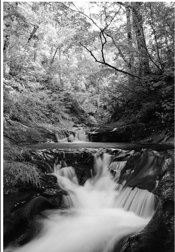
A beech forest in Tadami Town.

Abe Ryūsei, an elementary-school pupil, wrote this haiku in an impromptu haiku session with Mayuzumi. It reads like a natural, conversational utterance. But it fulfills the traditional haiku requirements of the set form of 5-7-5 syllables and the inclusion of a seasonal word.