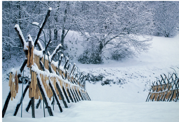
Daikon in winter.

Sendai was one of the cities hit hard by the earthquake and tsunami.