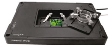
Affordable XY & XYZ Piezo Stages for SR Microscopy: P-545 Plnano®

Based on 40+ years of experience with electromagnetic and piezo-ceramic motors, PI can quickly provide a solution for your precision positioning and automation projects. Design centers are located in the USA, Europe, and Asia with global support of 1300+ employees in 13 countries.