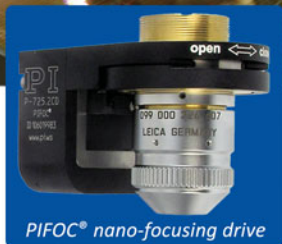
PIFOC® nano-focusing drive

Piezo stages & positioners are essential tools for high-resolution microscopy, such as Super Resolution Microscopy or AFM. Their sub-atomic resolution and extremely fast response allow researchers to create higher-quality images faster. PI provides a large variety of fast positioning stages and piezo objective nano-positioners for 3D imaging (Z-stack acquisition), fast-focusing applications, and light sheet microscopy.