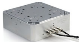
6-axis closed loop piezo stage for AFM: highly linear, < .1nm resolution