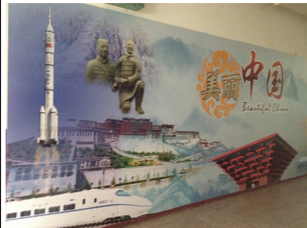
Mural on wall at Beijing boarding school.

on the mural, in English and Chinese, read “Beautiful China,” providing a gloss for the meaning of these juxtaposed images. Upon reaching a large conference room, we were welcomed to Beijing by an official from Hanban who further elaborated on the mural’s combination of the traditional and the modern. Although “the Great Wall is a famous symbol,” she took care to tell us, “now Beijing is a successful and modern city. It successfully held the Olympics.” Interpreting our presence as configuring desire, she added, “I’m so glad you find Chinese culture so amazing.”