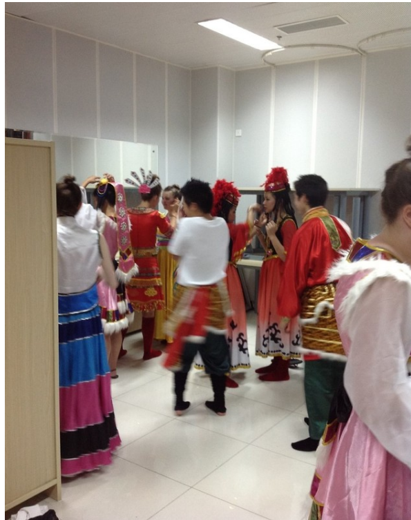
Preparing for the grand performance.

finale performance that would be presented in Beijing on the last evening of our stay. Local instructors had choreographed traditional and modern dance routines and selected students to perform, dressing them in traditional Chinese minority and Han costumes accessorized with feathered fans and elaborate headdresses. I grinned as I watched one Chinese American student, outfitted in a leopard-print costume, leap across the floor and proclaim himself the “Asian Macklemore,” a reference to the Seattle-based American rapper, and grimaced as I overheard the following exchange between two students: “What do we win if we’re the best group?” “Nothing. They make you stay in China longer.”