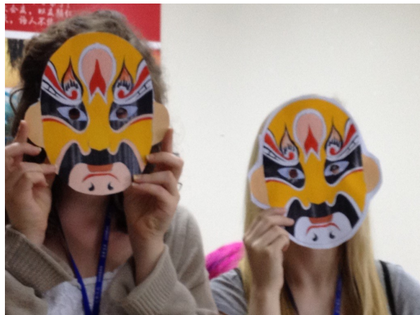
Opera mask activities.

As I watched the students perform China through these activities over the span of our visit, it increasingly became clear that the practices intended to promote soft power had actually backfired in several ways. While this may have been a result of cultural differences in expectations—with American students perhaps less tolerant of repetition and uniformity than their hosts expected—their effectiveness also appeared limited by Hanban’s strategy of defining authenticity as “Culture with a capital C,” demonstrated by these projects’ failure to produce the intended admiration and appreciation. “Do we really have to do this?” one student moaned as an instructor pulled out piles of red paper and boxes of scissors to explain traditional Chinese paper-cutting techniques, complaining that “I’ve done this so many times.” To spur interest, one of the chaperones suggested having a competition for the best paper cut, but it seemed to have little effect, as evidenced by a row of boys in the back napping with their heads on the tables. And on opera-mask-painting day, students engaged not only in eye rolling and nap taking, but also, to the displeasure of the teachers, took considerable poetic license with their projects, several of which more closely resembled characters from