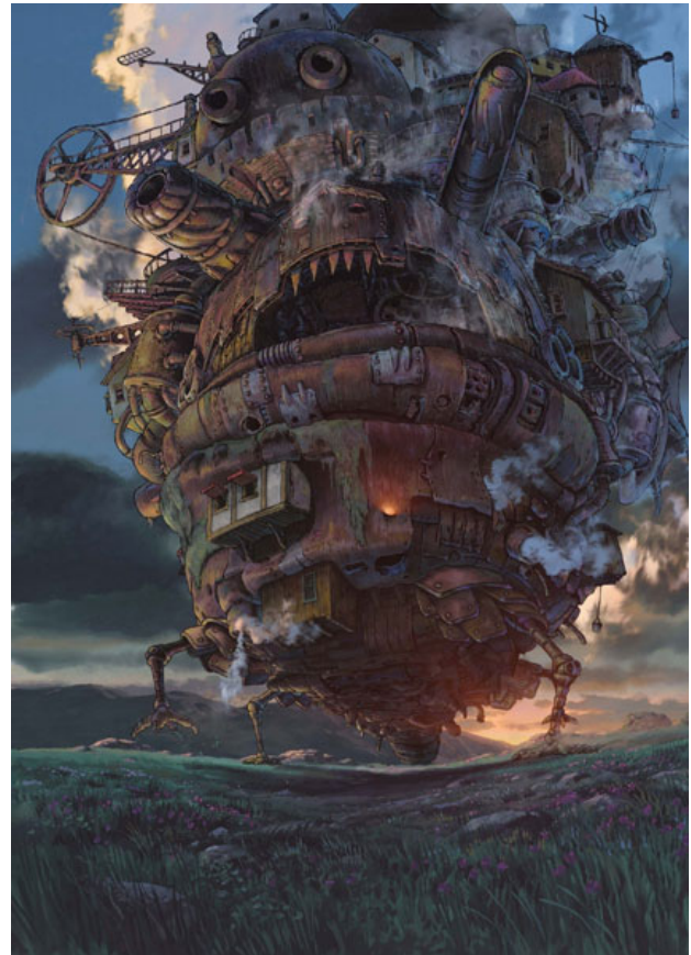
From Howl's Moving Castle

But it wouldn't be quite right to describe Miyazaki's approach as wholly Japanese. As with fantasy writers in the British tradition, from C.S. Lewis to J.K. Rowling, Miyazaki makes the details of the worlds he creates concrete and coherent, so that we might better suspend our disbelief for the big leaps of fantasy. This devotion to realism, Suzuki acknowledges, "is rare in Japanese animation," which tends to revel in the freedom from earthly laws that the medium allows. Miyazaki can be steely in pursuit of this goal. In a Japanese television documentary about "Spirited Away," he is shown at a meeting with his young staff, explaining how they are to draw certain images based on his storyboards. "The dragon is supposed to fall from down the air vent, but, being a dragon, it doesn't land on the ground," Miyazaki says. "It attaches itself