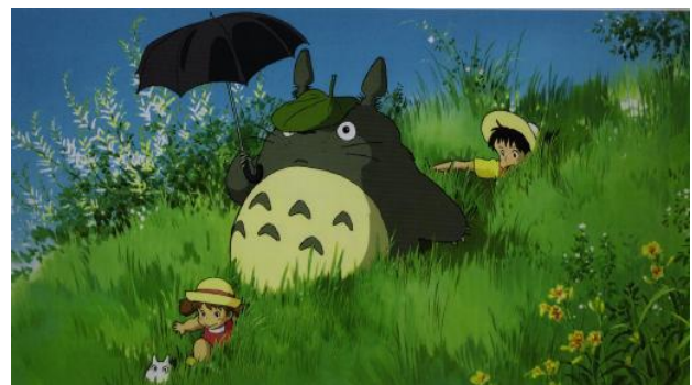
A scene from My Neighbor Totoro

Satsuki, are not idealized; they are at once goofy, brave, and vulnerable, like a lot of kids. The sisters have just moved with their father to a new house in rural Japan. Gradually, the two girls discover a host of strange but benign woodland creatures: fuzzy little soot sprites that hang out in old houses and hide when you turn on the lights; the plump, whiskered Totoros, who live in the roots of a giant camphor tree; and the marvelous cat bus, with its headlight eyes, caramel-colored stripes, and extra legs that function as wheels. (In a 1993 televised discussion between Miyazaki and the director Akira Kurosawa, Kurosawa mentioned how much he admired the sweetly surreal cat bus.) There is a gentle hint of Shintoism in all this: the father, an anthropologist, respectfully accepts the notion that the forest is presided over by spirits, though he is no longer able to see them, as his children can. Unlike the animals in most American cartoons, these creatures are not excessively anthropomorphized; they don’t speak, which somehow makes them seem both more plausible and more dignified, and which gives the girls the delightful challenge of interpreting them. In fact, the film is focused on dignifying the girls’ imaginations, honoring their ability to partake in a fantasy that is both comforting and fortifying—for we gradually learn that they are separated from their mother, who is ill and in the hospital.