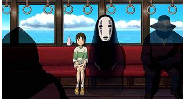
A scene from Spirited Away

both emotionally precise and fantastical. It's like every solitary journey you've ever taken, when you felt lonely and a little exalted, but it is also deeply strange, for the train glides, stately and surreal, over a translucent blue sea, while the sky slowly ripples through the possibilities of a sunset, from the pink of crushed petals to a soft, forgiving black.