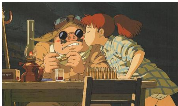
A scene from Porco Rosso

Miyazaki's movies are threaded with other personal obsessions, just as samurai imagery pervades Kurosawa's work. Pigs, for example, turn up in many films. ("The behavior of pigs is very similar to human behavior," Miyazaki has said. "I really like pigs at heart, for their strengths as well as their weaknesses.") A 1992 film, "Porco Rosso," tells the story of a pig that flies—he's a pilot who works the skies over the Adriatic before the Second World War. In one tender scene, the pig recalls the air battle in which his fellow flying aces just kept ascending—floating ever upward into a cold empyrean death—while he, a more earthbound creature, could not face such self-sacrifice. Next month, Disney, the American distributor of Miyazaki's films, will release a video version of "Porco," whose title character will be voiced by Michael Keaton. It will also make available an English version of "Nausicäa," with voices by Uma Thurman and Patrick Stewart. With these two releases, the entirety of Miyazaki's eccentric output will be available in good English versions for the first time.