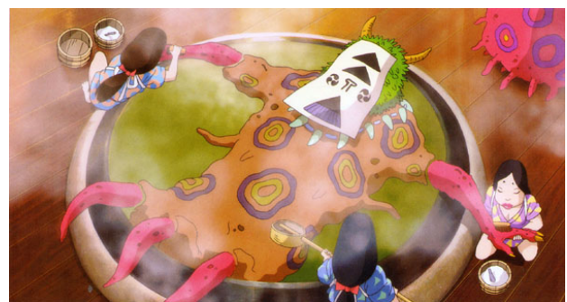
A scene from Spirited Away

Miyazaki began his animation career in the nineteen-sixties, at a time when the economic miracle that had swiftly transformed postwar Japan into one of the strongest economies of the world was, almost as swiftly, obliterating its countryside. In the nineteen-eighties, the government cleaned up the worst industrial pollution, but Japan is still a country where developers (especially golf-resort planners) have free rein, where most people prefer nature in tamed and miniaturized form (bonsai, Zen gardens, lavishly packaged tiny melons), and where few places are untouched by commerce (there are vending machines on Mt. Fuji). “ Spirited Away ” contains a memorable scene in which a gloppy-looking creature—the spirit of a polluted river—comes to a bathhouse to be cleansed; a lot of dirty, foul-smelling labor is required. For this sequence, Miyazaki drew on his own memories of cleaning up a river—and pulling things like bicycles out of the muck.