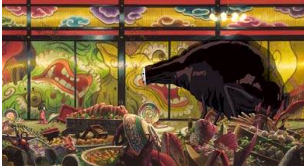
Chihiro encounters No Face in Spirited Away .