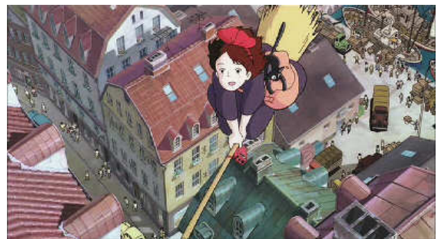
A scene from Kiki's Delivery Service

Toshio Suzuki, a wry, articulate man with close-cropped silver hair and an elfin grin, is Miyazaki's producer and longtime collaborator. "When silents moved to talkies, Chaplin held out the longest," he told me. "When black-and-white went to color, Kurosawa held out the longest. Miyazaki feels he should be the one to hold out the longest when it comes to computer animation." Miyazaki lavishes particular attention on his backgrounds, which are full of painterly flourishes. I'd never really noticed the colors in an animated film until I noticed his. Skies and seas are saturated in strangely emotional blues; wet halos surround the red lantern and absinthe-green neon signs in "Spirited Away"; in "Kiki's Delivery Service," the young witch's dress isn't quite black—it's the smudged purple of the darkest plums.