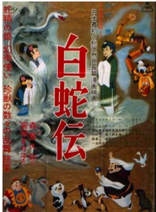
Poster for Legend of White Snakes

him. "My soul was moved and I stumbled back home in the snow that had just started. Comparing my pitiful situation to the characters' earnestness, I was ashamed of myself, and cried all night." At the time, he had been trying to write a sophisticated, absurdist manga, but he realized, somewhat to his embarrassment, that he was more interested in creating something sincere.