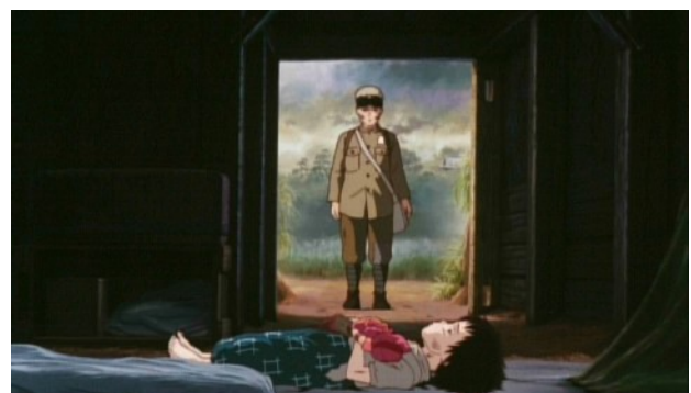
A scene from Grave of the Fireflies

Takahata and Miyazaki, who worked together so closely for years, have lately moved in different directions. Takahata is more interested in literary and film theory, more cerebral and less enamored of magic. His films are not for children, and “Grave of the Fireflies” could easily have been a live-action film. Takahata is sixty-nine, but he has a formidable head of dark hair and a handsome, unwrinkled face. “With Miyazaki, you have to totally believe in the world of the film,” Takahata told me. “He is demanding that the audience enter the world he has created completely. The audience is being asked to surrender.” He paused. “I want the audience to have a little distance. My relationship with him is limited now. We are friends but we don’t have a direct working relationship.”