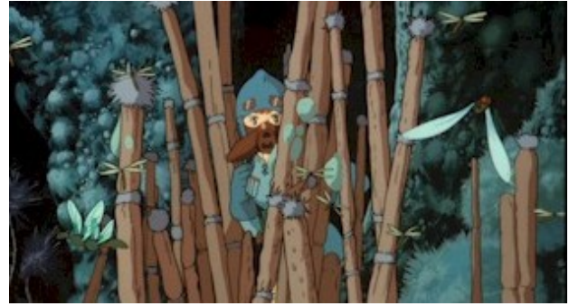
A scene from Nausicäa of the Valley of the Wind

Miyazaki’s films are also striking for their preoccupation with the environment, and their not entirely metaphorical suggestion that the natural world is capable of remembering what’s been done to it. (He believes that we harbor “memories in our DNA from before we took the form of humans.”) “ Nausicäa of the Valley of the Wind ” (1984) is set in a post-apocalyptic world where humans live huddled on the edge of a toxic forest. Its heroine finds beauty in the lush, strangely colored undergrowth and the giant cicada-like insects that dwell there, nursing a grudge against the humans who’ve poisoned their habitat.