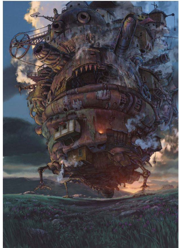
From Howl's Moving Castle