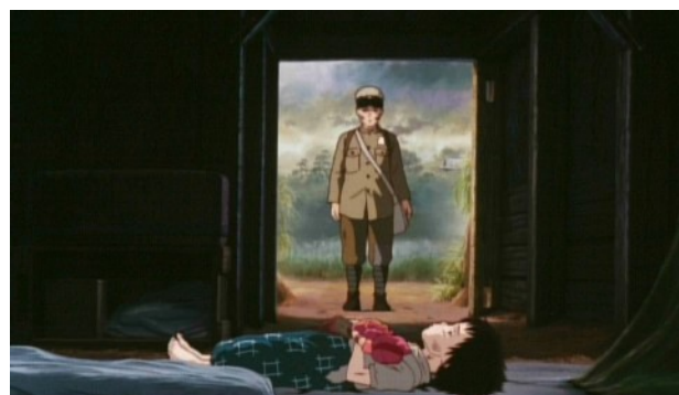
A scene from Grave of the Fireflies

Takahata and Miyazaki, who worked together so closely for years, have lately moved in different directions. Takahata is more interested in literary and film theory, more cerebral and less enamored of magic. His films are not for children, and “Grave of the Fireflies” could easily have been a live-action film. Takahata is sixty-nine, but he has a formidable head of dark hair and a handsome, unwrinkled face. “With Miyazaki, you have to totally believe in the world of the film,” Takahata told me. “He is demanding that the audience enter the world he has created completely. The audience is being asked to surrender.” He paused. “I want the audience to have a little distance. My relationship with him is limited now. We are friends but we don’t have a direct working relationship.”