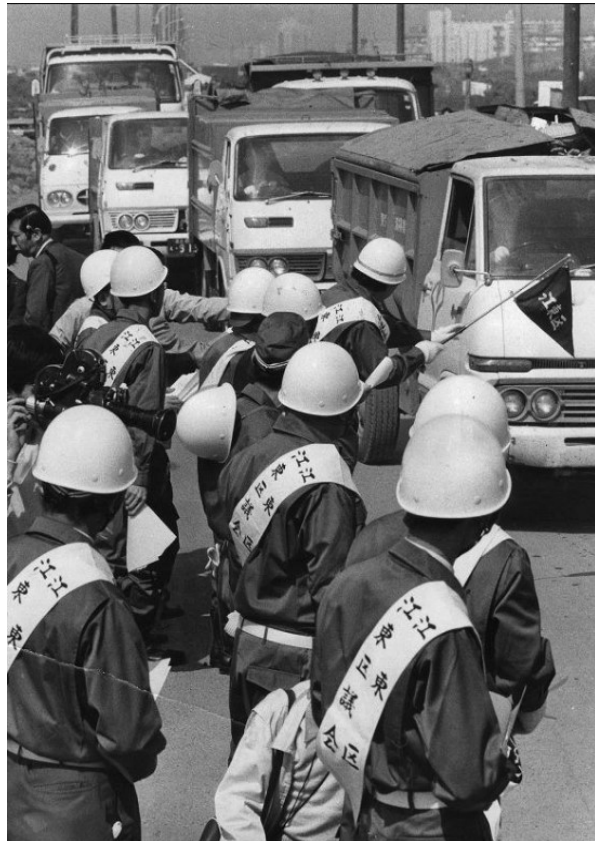
Members of the Kōtō ward assembly checking garbage trucks entering their ward for those carrying rubbish from Suginami ward. May 22, 1973.

opened their newspapers and turned on their televisions to witness members of the Kōtō ward assembly in helmets, physically barring entrance to Landfill Number Fifteen. And for at least the few days when collection was suspended, denizens of Suginami ward encountered piles of garbage spreading across their sidewalks. 10 The presence of rubbish, made inescapable by Kōtō's actions, helped force an intervention by Minobe, who persuaded Kōtō to end its blockade and resumed negotiations with a Suginami ward more committed to figuring out a site for construction of its incinerator. 11