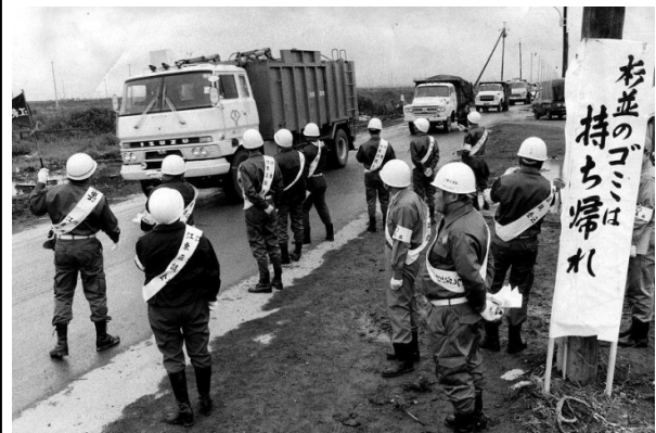
The sign reads, "Take Back Suginami's Garbage." May 23, 1973.

The political conflicts about the construction of incinerators shone a light on the sheer volume and unceasing accumulation of garbage, as well as on the desire of many Tokyoites not to have to see or deal with that garbage in their daily lives. Insofar as Minobe had hoped to draw attention to the garbage problem, he succeeded; but his aim of urban infrastructure development bumped up against the understanding, even the visceral feeling, that garbage was filthy, that it was to be carted away and kept at a distance. This conception of rubbish was implicit in the stances of Suginami ward and others that resisted Minobe's sanitation plans. A documentary aired by the national broadcaster NHK in October 1973 highlighted and exemplified the ways in which concerns about visibility and invisibility were inherent in the clashes over garbage. The very title of the half-hour program, Gomi to tokonoma (Garbage and the Alcove), alluded to the question of how garbage should be seen with its evocation of the tokonoma , a raised and recessed space in a Japanese-style room in which an object (typically art, a scroll, or