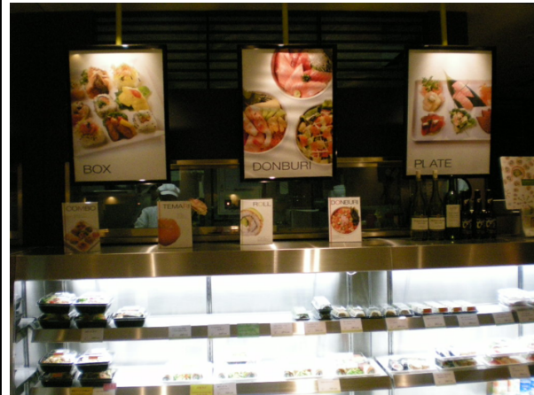
Some of the sushi available at Genji’s counter

All seats are non-smoking, which is rare for a Japanese restaurant. 16 There is a takeaway glass-fronted display with salads, sushi sets, and other “healthy” foods displayed. The signage is in English only, and the items on the menu, written in English, have descriptions in Japanese. The menu includes a vast array of fusion sushi and donburi (rice with topping) – California Don, Tuna and avocado Don, Genji seafood salad, etc., with prices set at modest levels. The average cost of a single meal “set” was around 1,000 yen. There were only two employees in the entire restaurant with seating for about 30, so service was negligible, reflected in the price of the food perhaps.