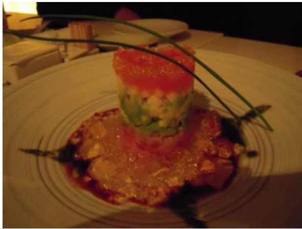
Rainbow Roll Sushi's tuna and avocado stack