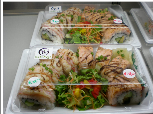
Genji's seared salmon rolled sushi with salad

some donburi (rice with in this case rather unconventional toppings) items such as California-don (raw tuna 17 and avocado) or donburi with organic green onion and raw tuna salad. Genji's main selling points are that it is “New York” sushi – it is the sushi that people in New York eat – and that the food it sells is healthy and stylish. In a slightly ironic twist, the chain has employed the same marketing strategy employed overseas to sell this overseas variant of sushi to Japanese; that is, it has emphasised the “healthy” aspect of eating their particular kinds of sushi to an extent almost never seen in Japan. Arguably, within Japan sushi is not perceived as particularly “healthy.” Rather it can be perceived as convenient, cheap, accessible, familiar, or expensive, distinctive and bought for special occasions etc. But the population generally does not need to be educated to eat sushi (ultimately it is simply a matter of choice, unlike in other nations, where marketing strategies may involve educating customers that eating sushi is a rational, healthy, and economic choice).