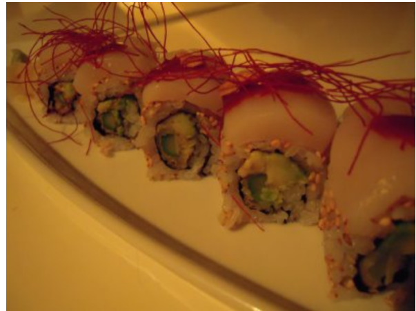
Rainbow Roll Sushi's spider roll

There is a substantial central table made of backlit marble, around which perhaps 20 diners can be seated, there are semi-enclosed split-level zashiki (Japanese-styled tatami mat booths) that overlook the central table, and there are seats available at a sushi bar. With the dim lighting, the panopticon-like views from the central dining table over the restaurant, the monochromatic décor, the Latin American sound track, and the subdued but lively buzz of conversation from the partially sound-shielded booths, the restaurant would not be out of place in New York, London, Rio or Sydney. Staying with the theme of discreet sophistication, most of the food preparation is conducted behind the sushi bar, in a kitchen that is not visible to customers. Sushi chefs do make sushi at the bar, but they produce only rolled sushi; the more exotic sushi that involves items like seared scallops, cooked prawns, etc. is made in the kitchen, as it is in most sushi restaurants.