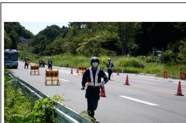
12 September 2012, police roadblock 10km north of Fukushima Daiichi nuclear plant

meltdown. This means that there was no control sample from elsewhere in Japan that was not affected by fallout at this time or earlier. The survey does, however, include 42,060 children from other parts of the prefecture.